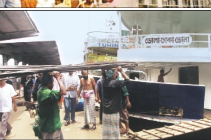
FOOLS NEVER LEARN... Four days after the tragic launch capsize in the Meghna, an overcrowded launch sallies for Dhaka from Bamna on Saturday. At Sadarghat launch terminal, iron rods are being loaded onto a vessel, a major reason for the capsize in the Meghna.