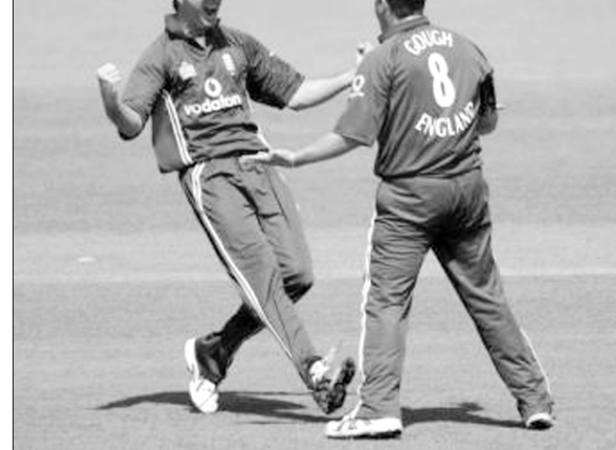
England's Darren Gough celebrates with skipper Michael Vaughan after taking South Africa's Jacques Kallis' wicket at Lord's yesterday.

Umpires: Simon Taufel (AUS) and Neil Mallender (ENG) Toss: England Result: England won by seven wickets.