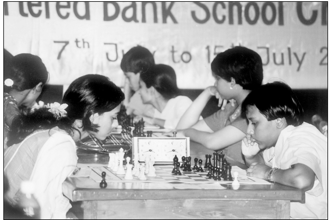
Scene from yesterday's sixth round engagements of the Standard Chartered bank school chess tournament at the NSC.

At the Uttara Police Lines ground, Badda Alattunessa High School defeated BIT 2-1 and the other match at this venue between Kanchakra High School and Scolastica ended in a 1-1 draw.