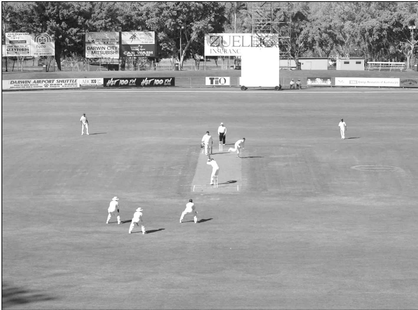
A Northern Territory Chief Minister's Eleven batsman lets a Mashrafe-bin-Mortuza delivery go during the third day's play of the tour match against Bangladesh at the Murrara Oval in Darwin yesterday.