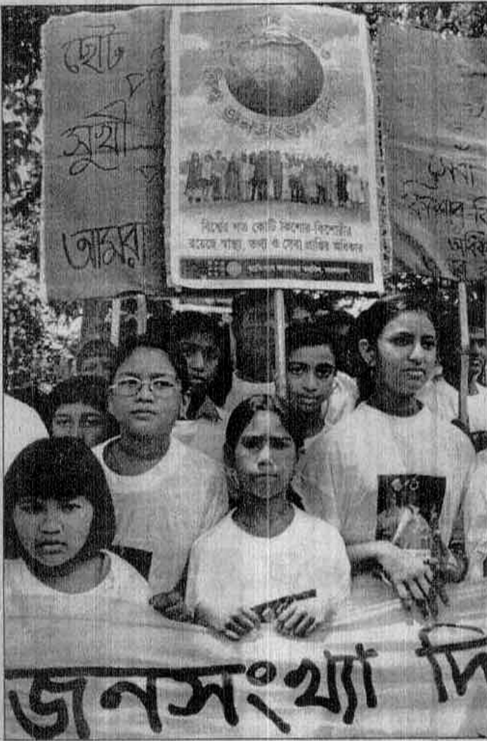
Children take part in a procession in the city yesterday marking the World Population Day.