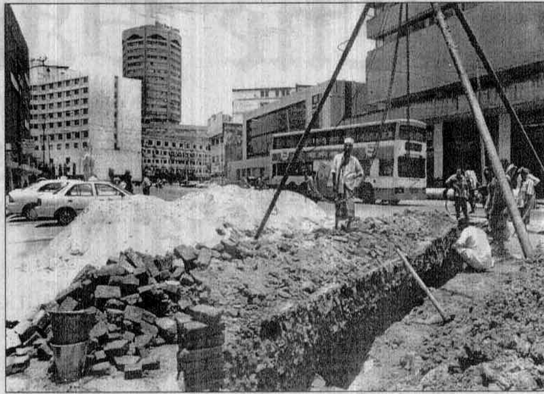
Fresh road-digging at Motijheel bears testimony to the lack of coordination among different government agencies. The drainage department of WASA has dug up a part of the road at Motijheel although it has been repaired recently.

STAFF CORRESPONDENT Mirpur police recovered the body of a young man hanging from a ceiling fan inside a hotel room on Thursday night.