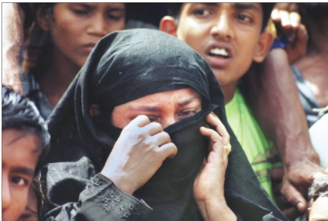
A woman fights her tears back as she waits on the river bank in Chandpur yesterday for her relatives, feared drowned in the Meghna. The triple-deck MV Nasrin-1 sank in the turbulent waters of the river Tuesday night.

Strong current keeps rescuers at bay; 3 bodies recovered; 150 swim ashore