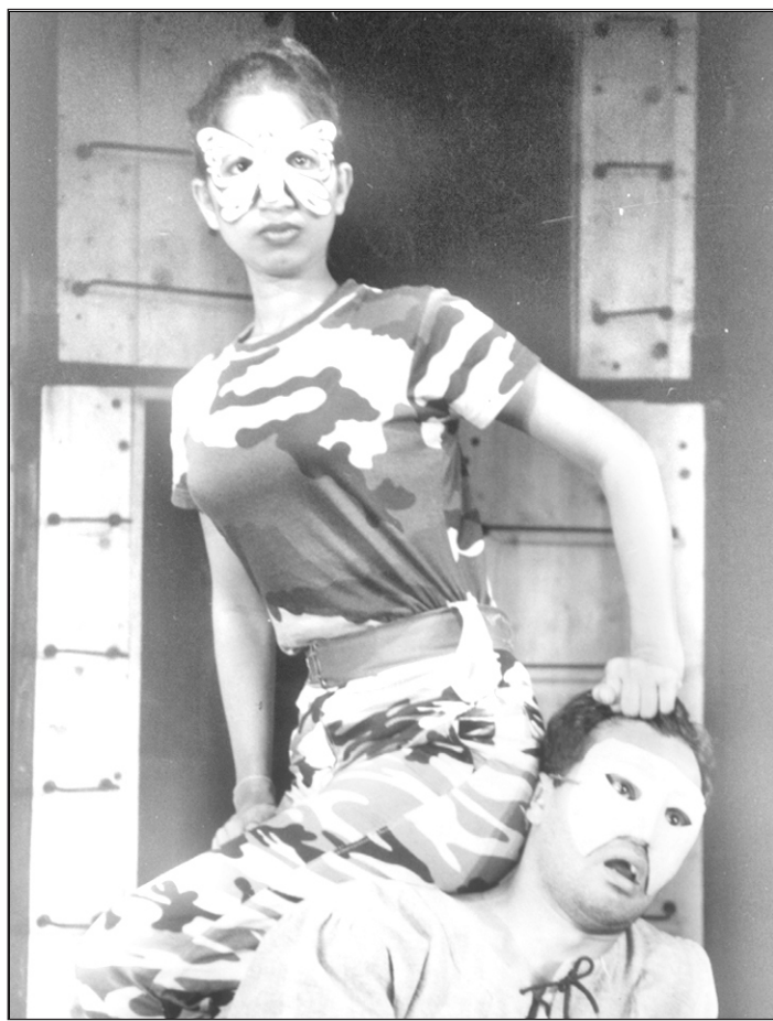
Masks have been used to lend the production a visual richness.

KN: The three emissaries assigned to foment the revolution of the blacks, one of whom was a Jamaican slaver's son, arrived in Jamaica. Very carefully they began to proceed by assuming masks as if they were not at all against the world of masters and slaves. This was an attempt of the National Assembly of France willing to