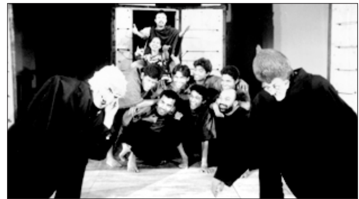
The spectacles of songs and dances are an amalgam of modern and traditional movements in the play.

KN: Use of symbols is manifold, both in the text by Muller and in the visuals I depicted in the production. In my production, Muller's character of First Love has turned out to be the symbol of beauty, power, militarism and neo-colonialism that one can easily relate to the world perspective. Here betrayal and beauty are interrelated as one's submission to beauty can necessarily bring about