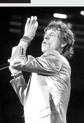
Rolling Stones lead singer Mick Jagger performs in Velodrome Stadium in Marseille 05 July during the band's first French concert for its 'Forty Licks Tour'.