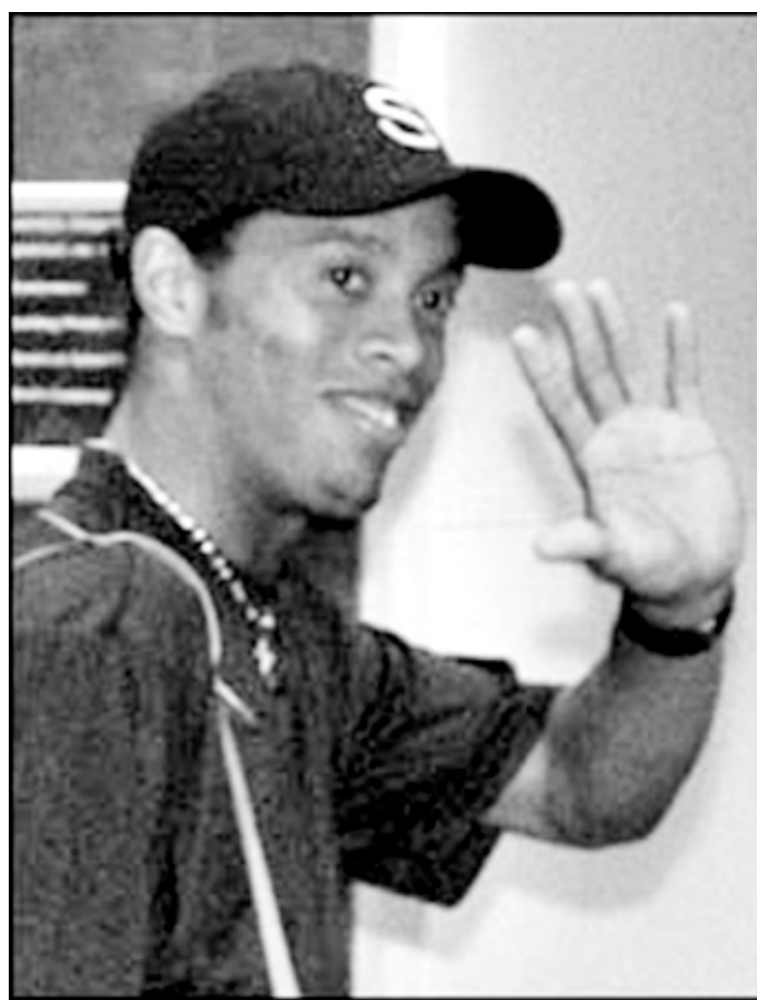
SEE YOU AGAIN? Brazilian superstar Ronaldinho waves bye at London's Gatwick Airport while boarding a plane for Madrid on July 5.

has promoted a video game in London and filmed an advert in Madrid, providing the perfect platform for continued talks.