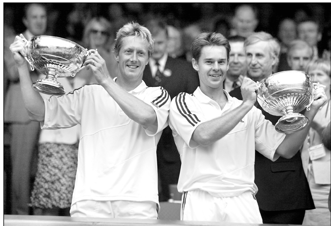
Jonas Bjorkman (L) and Todd Woodbridge raise their trophies after the men's doubles final on Saturday.