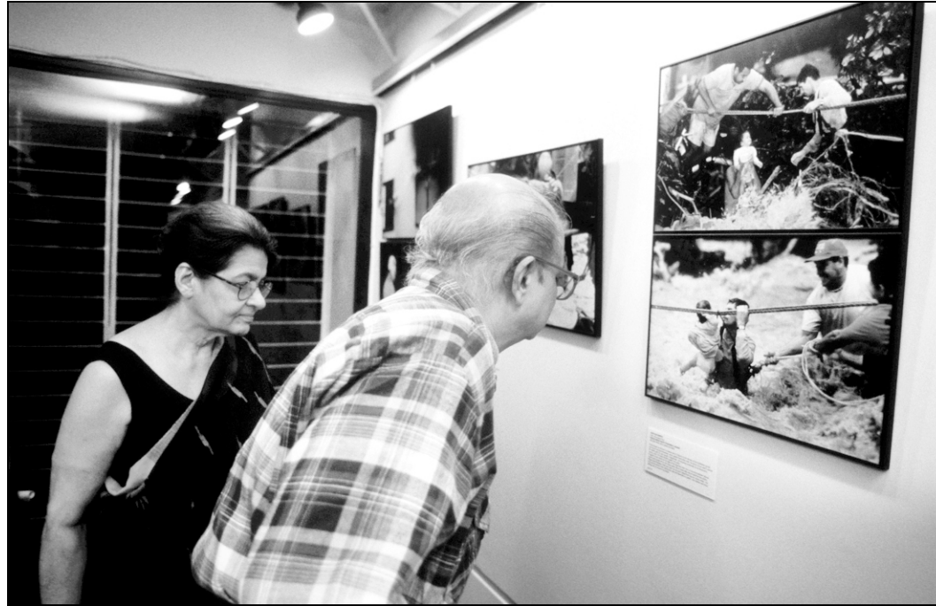
The gallery is more suitable for the exhibitions of photographs than paintings.

There is basically one large gallery which has been divided into