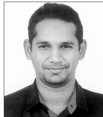
BASHAR ... 99

overs) and fellow medium-pace Callum Ferguson (2-5 off five) were the Academy's main wicket-takers. In their second innings, the