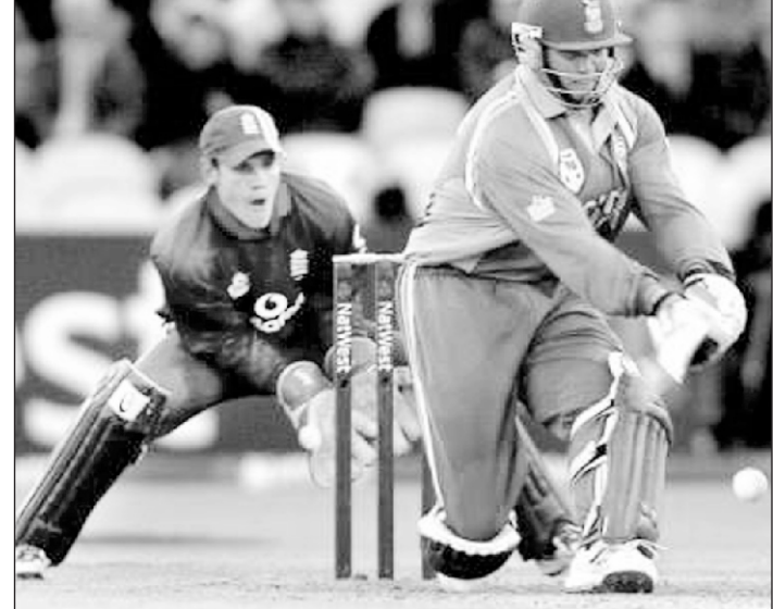
South Africa's Jacques Kallis sweeps during the NatWest Series one day international against England at Old Trafford on Thursday.