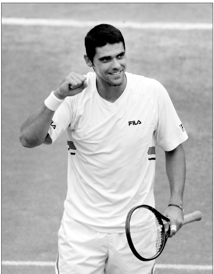
Mark Philippoussis pumps his fist during his Wimbledon semifinal against France's Sebastien Grosjean yesterday.