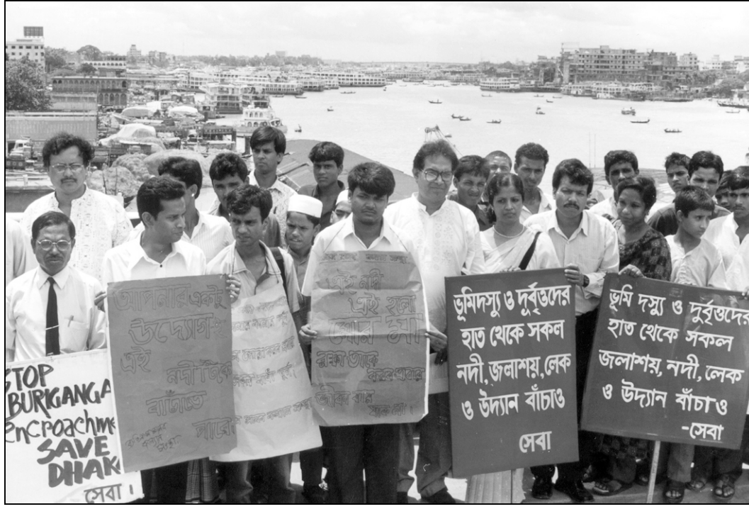
Bangladesh Paribesh Andolon forms a human chain on the 2nd Buriganga Bridge yesterday demanding steps to prevent encroachment on the Buriganga.