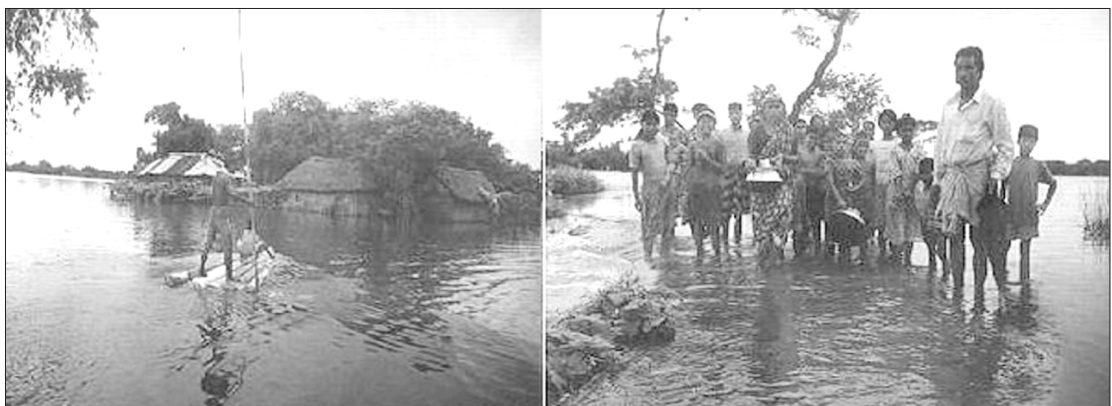
Living with flood: (left) A flood affected family at Jharsinghersar village in Dimla in Nilphamari district moving to safety and (right) victims who took shelter on the flooded Dantirchar embankment at the village setting out for collecting drinking water with utensils in hand. The photos were taken vesterday (Friday).

The affected upazilas are Pakundia, Kotiadi, Bajitpur, Kuliarchar, Bhoirab, Astagram and Mitaman