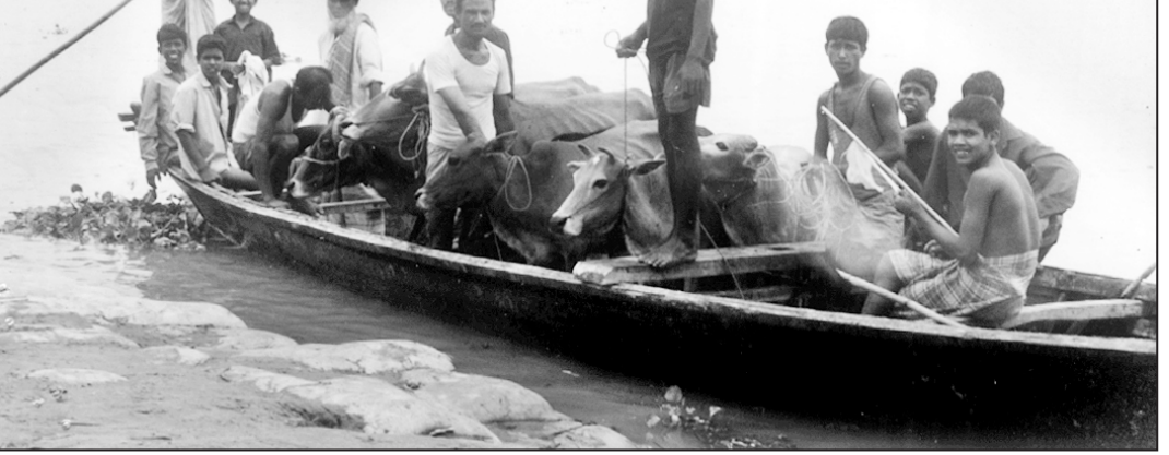
In search of dry land: Flood affected people of Parulia village under Hatibandha upazila in Lalmonirhat district on a boat along with cattle and other belongings in search of a safe place.