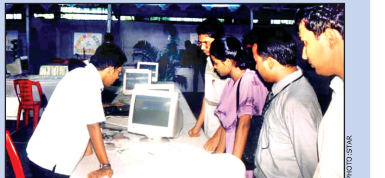
Enthusiastic youths crowd Computer Fair at Chittagong Stadium Gymnasium organised by the Micro-bangla