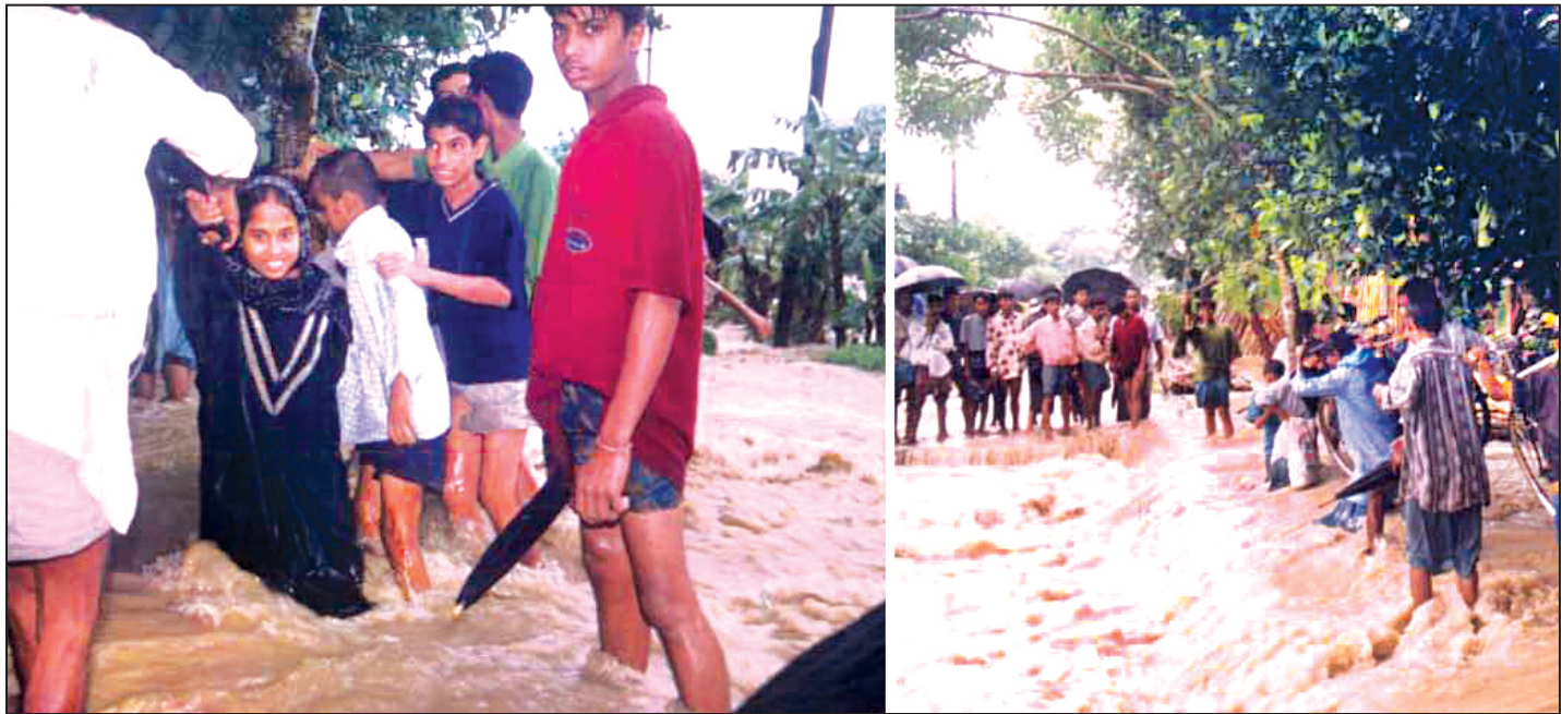
Flash flood caused by torrential rain and onrush of hilly water submerged eight unions, out of twenty, of Fatikchhari here this week. The picture was taken from Fatepur area on Sunday.

Another omission in his assessment was that he did not seem to realise that much of the sexual activity in the slum was related to organised crime syndicate that manages the slum life from behind the scene. He also failed to mention the percentage of children involved in pedophilia or child-sex trade in the slum.