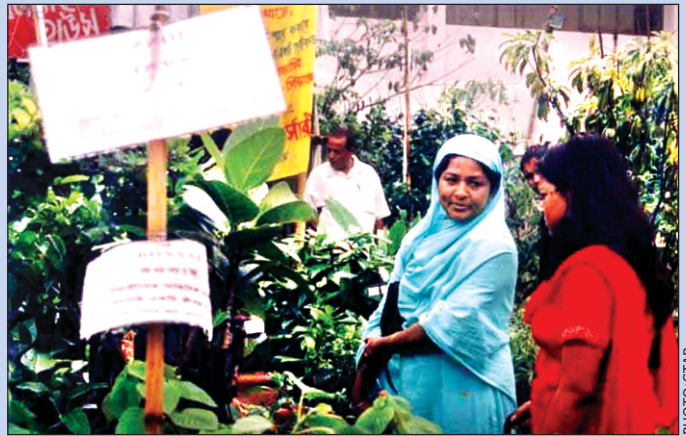
Tree lovers at month long tree fair on Chittagong Stadium Gymnasium complex premises. Chittagong City Corporation organised the fair.