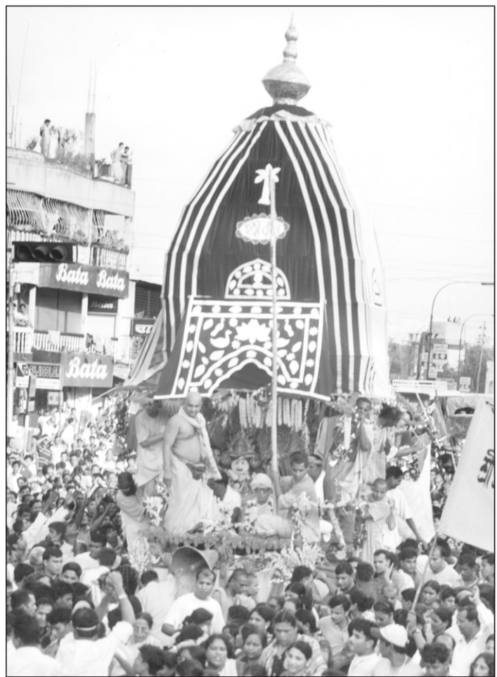
Hindu priests lead Ratha Jatra, a chariot festival, organised by the International Society for Krishna Consciousness (ISKCON), in Dhaka yesterday.

The local BNP held two meetings yesterday at Shaheed Khokon Park in the town and at Battala in Kahalu to protest what they said the anti-state activities of the AL.