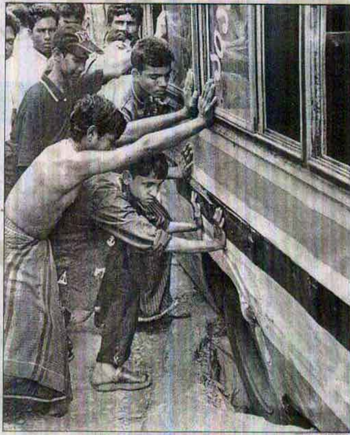
People trying to lift a minibus that got stuck in a broken manhole at Pallan yesterday. The roads in different parts of the city have been in bad shape for long, but the authority seem indifferent to the woes of the passengers and pedestrians.