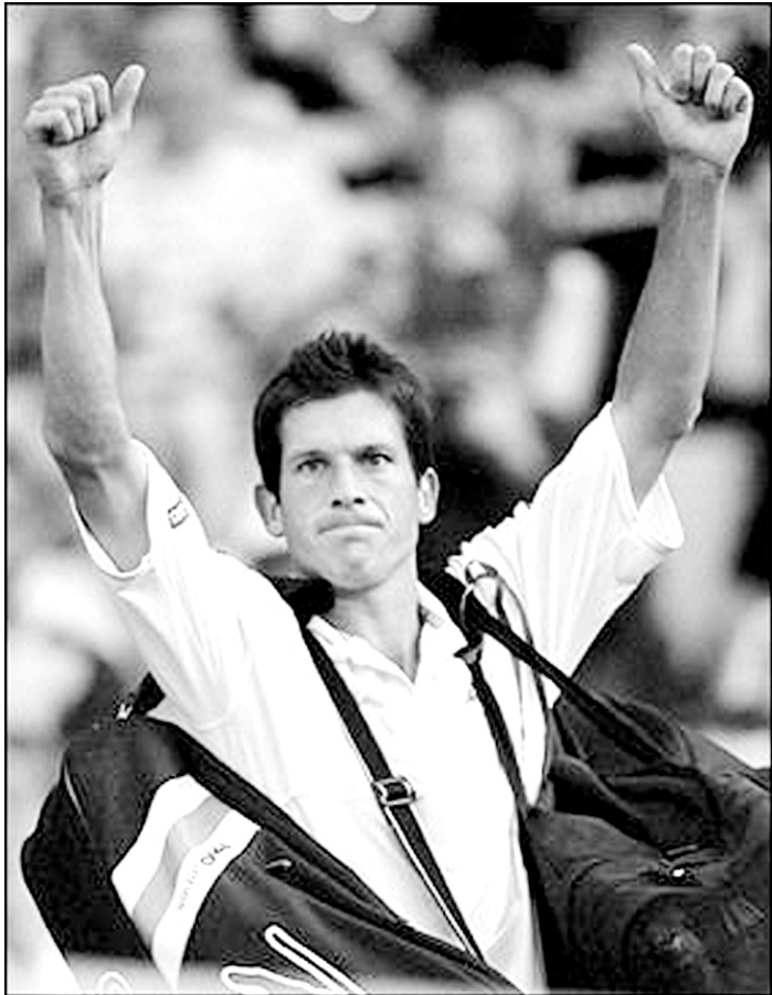
Briton Tim Henman celebrates after beating Robin Soderling of Sweden at the Wimbledon Championships on Saturday.

"I feel at home when I'm here and I've always played well even in the smaller tournaments so there must be something in it."