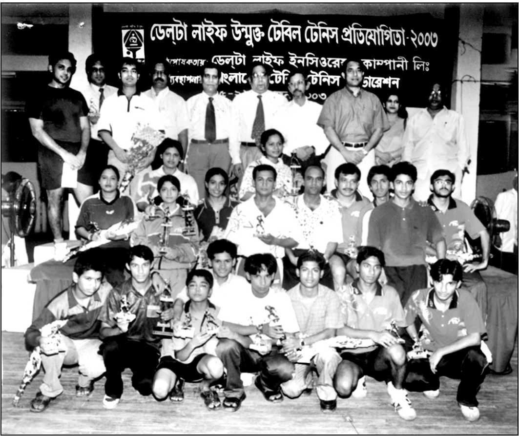
Winners of the Delta Life Open Table Tennis competition pose with the guests yesterday.

ZIMBABWE: Marillier, Ebrahim, Friend, Flower, Taibu, Matsikenyeri, Streak, Ervine, Blignaut, Price, Hondo Toss: Zimbabwe Umpires: Billy Bowden (New Zealand) and Neil Mallender (England)