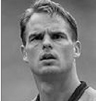
FRANK DE BOER

Frank de Boer, who has won more than 100 caps for the Netherlands, said he would not join his brother in Scotland if he left the Nou Camp, saying he favoured playing in England or staying in Spain.