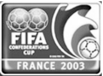
AFP, St. Etienne

Colombia reached the last four of the Confederations Cup by beating a gallant Japan side 1-0 here on Sunday.