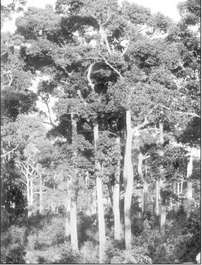
The last of the Garjans--will they survive the on-going massive felling?

Although trained as a journalist and writer in the first place, Philip Gain's interest and accomplishment in photography is clearly noticeable in the pictures placed on the exhibition. The images also project his close proximity with the complexities of the forests.