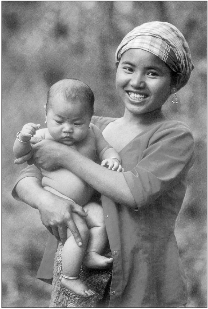
The children of the forest being uprooted from their habitation.