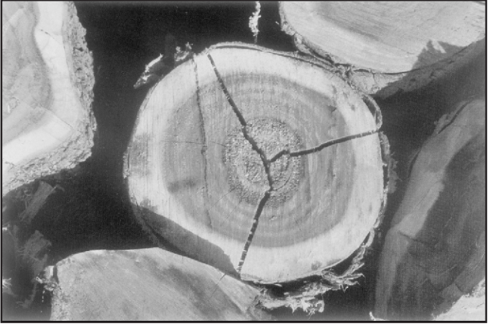
Acacia, one major source of lumber, easily gets split from the centre.

All programmes are in local time. The Daily Star will not be responsible for any change in the