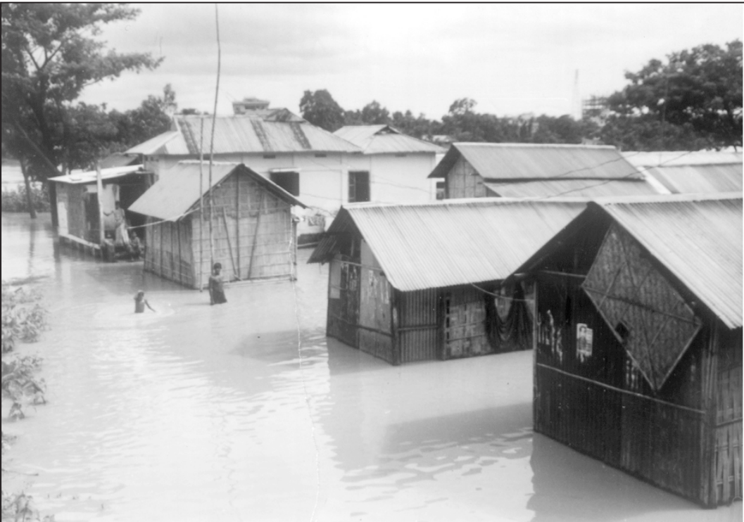
Flash food inundated 22 unions in Rajnagar, Kamalganj, Kulaura and Sreemangol upazilas in Moulvibazar district. The situation is likely to deteriorate as all the rivers in the region including the Monu and the Dhalai are rising with onrush of water from the upstream. Picture shows (left to right) inundated houses of Aqua village in Rajnagar upazila and a submerged road in Kamalganj upazila town.