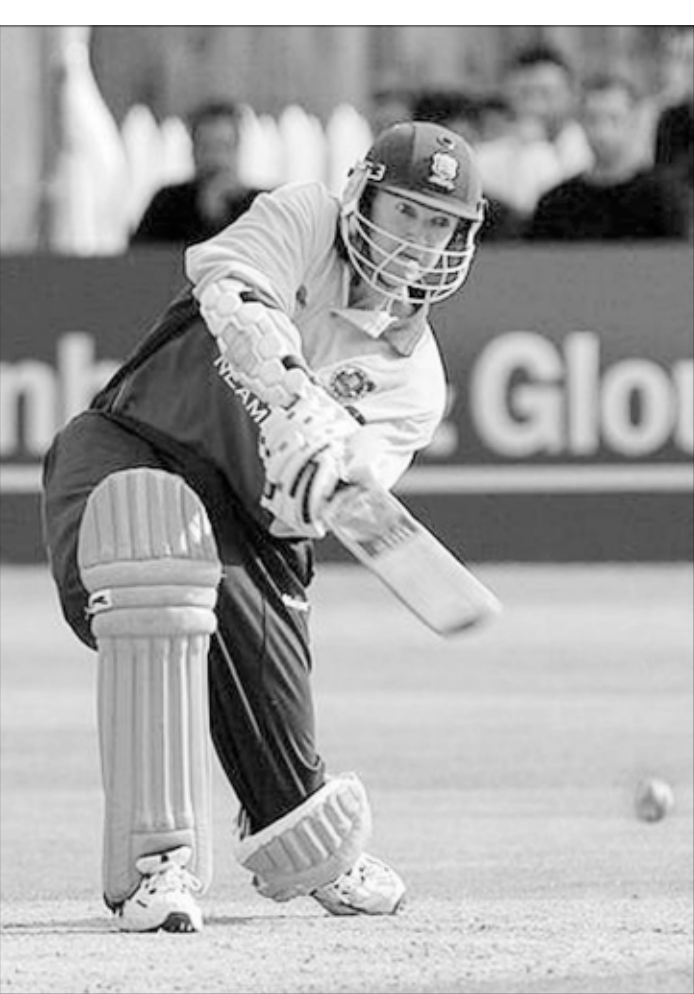
Essex's former Zimbabwean star Andy Flower drives on his way to his 114 not out against Pakistan at Chelmsford on June 9.

Sami and spinner Shoaib Malik, including Bopara after a brisk 46. After a narrow one-wicket win over Scotland in their tour open, Pakistan did little to improve their