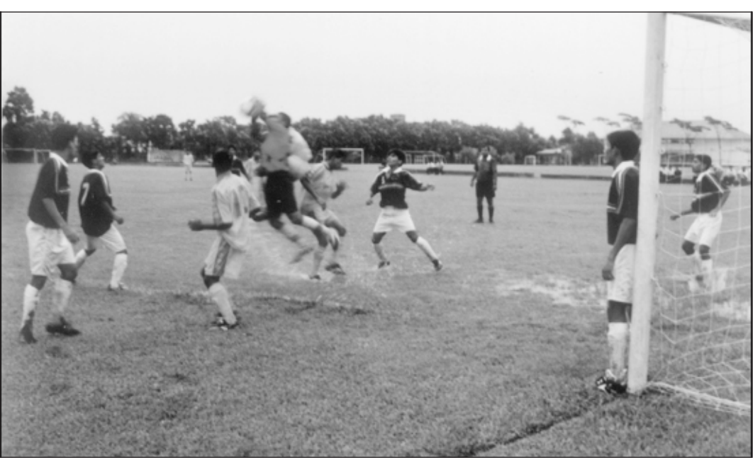
The BKSP custodian thwarts a Barisal attack during their BKSP Cup under-16 tournament match yesterday.