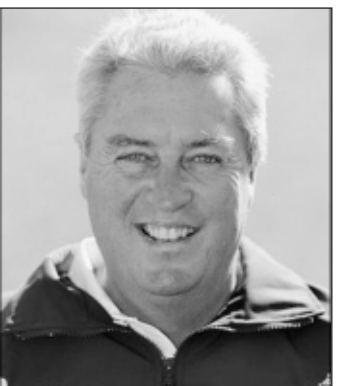
BOB WOOLMER response to his disparaging comments about Lance Klusener a

CRICINFO, Pietermaritzburg Bob Woolmer, the former South African coach, launched a scathing attack on Graeme Smith, in