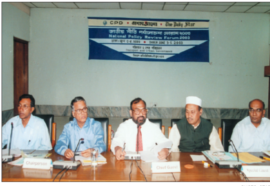
General Secretary of the Awami League Abdul Jalil, left, shakes hands with BNP Secretary General Abdul Mannan Bhuiyan at the close of the National Policy Review Forum 2003, organised by the Centre for Policy Dialogue, The Daily Star and the Prothom Alo, at Hotel Sheraton yesterday. Dhaka Mayor Sadeque Hossain Khoka, third from left, speaks as chief guest at a working session at CIRDA.