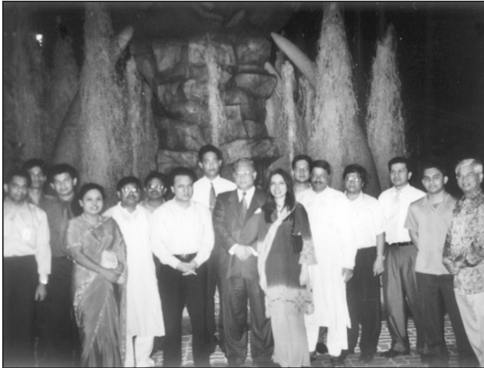
The SAFMA delegates pose for photo at Fantasy Kingdom.

A cultural programme was arranged by a dance troupe of the