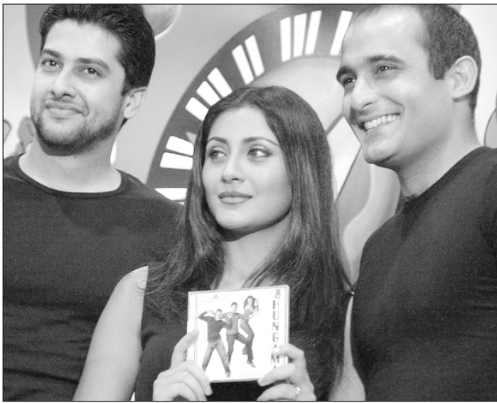
Bollywood stars (L to R) Aftab Shivdasani, actress Rimi Sen and Akshay Khanna, pose during the music launch of their film Hungama, a comedy thriller, in Bombay on May 28. The film is scheduled for release by the end of June 2003.