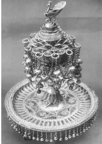
Ottar container, German silver, 20th century.

The idea of this year's theme 'Museums and Friends' can be traced back in the 17th century Europe. A group of enlightened people--collectors and connoisseurs of artistic, scientific and historical antiquities, artists,