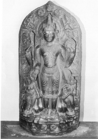
Lord Vishnu, Black marble, 12th century.

It was, however, 15 years since the Day had been first celebrated that ICOM decided to choose a theme for each year. In 1992 the first theme was decided to be 'Museums and Environment.' In 1993 it was 'Museums and Indigenous Peoples', in 1994 'Behind the Scenes in Museums', in 1995 'Response and Responsibility', and in 1996 'Collecting today for tomorrow.' 1997 and 1998 jointly decided one theme--'The fight against illicit traffic of cultural property.' In