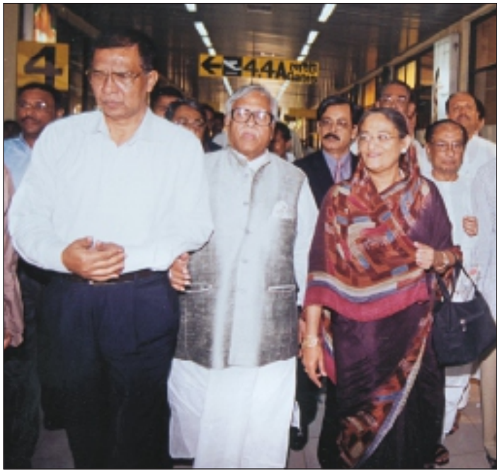
Awami League (AL) leaders see off Sheikh Hasina at Zia International Airport Thursday. The AL chief is now on a visit to Europe and the United States.