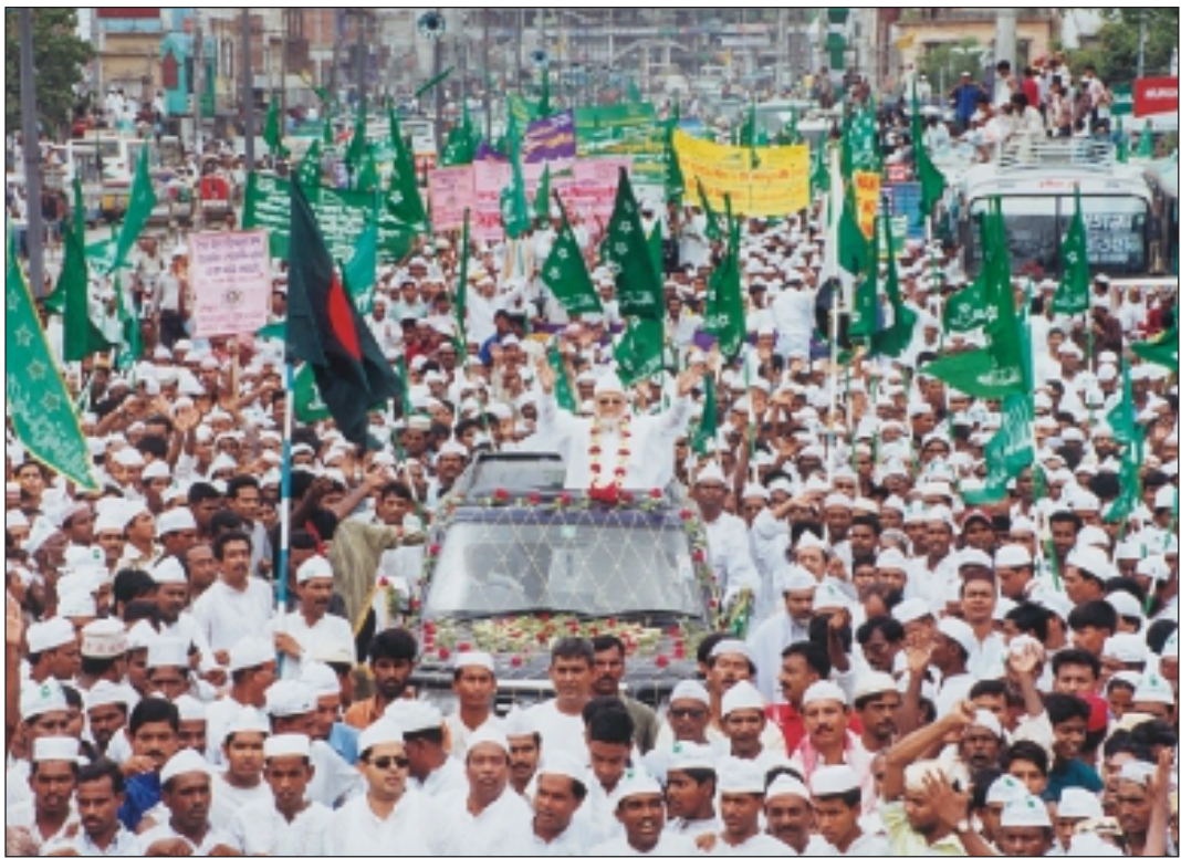
Devotees parade through city streets in a colourful procession Thursday to observe Eid-e-Miladunnabi, the birth and death anniversary of Prophet Hazrat Muhammad (PBUH).