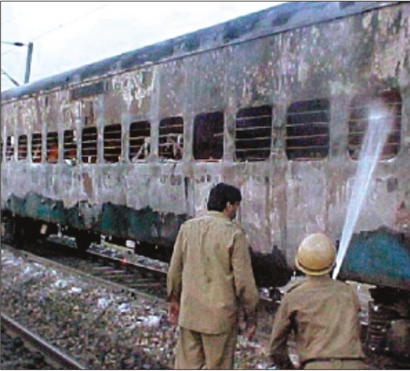
Indian firefighters, left, pour water on the cinder of a fire which broke out on a train at Ladhawal, some 250km northeast of New Delhi, Thursday, in which at least 38 people were burned to death, mostly women and children. A nurse attends an injured train passenger at Christain Medical College (CMC) hospital in Ludhiana.