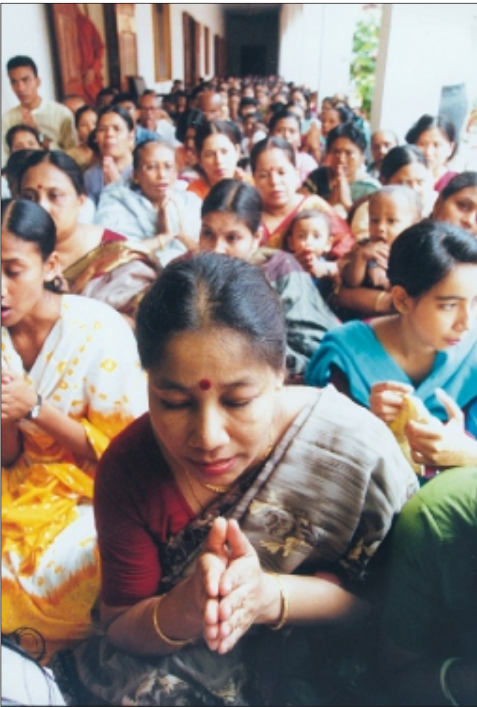
Buddhists offer prayers to observe Buddha Purnima, the birth, death and nirvana anniversary of Lord Buddha, at a pagoda in Bashabo Thursday.

The fate of the crew of the vessel was not known immediately.