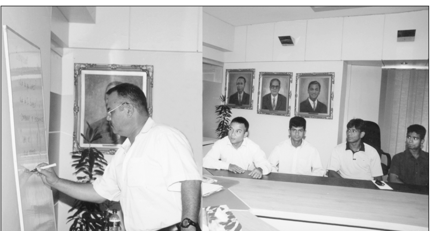
New Bangladesh cricket coach Dav Whatmore trying to make the leading players understand something by putting it on board during his first meeting with them at BCB's Gulshan office yesterday.