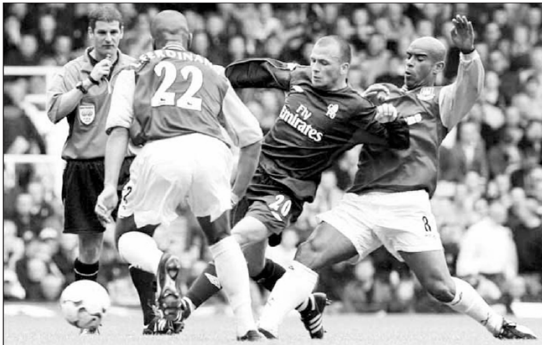
Chelsea's Jodi Morris (C) is sandwiched between West Ham's Trevor Sinclair (R) and Les Ferdinand in London on May 3.

Fulham and Aston Villa both ensured they will remain in the top flight next season with wins over Everton and Sunderland respectively, leaving West Ham, Leeds and Bolton in a three-way fight to avoid the drop.