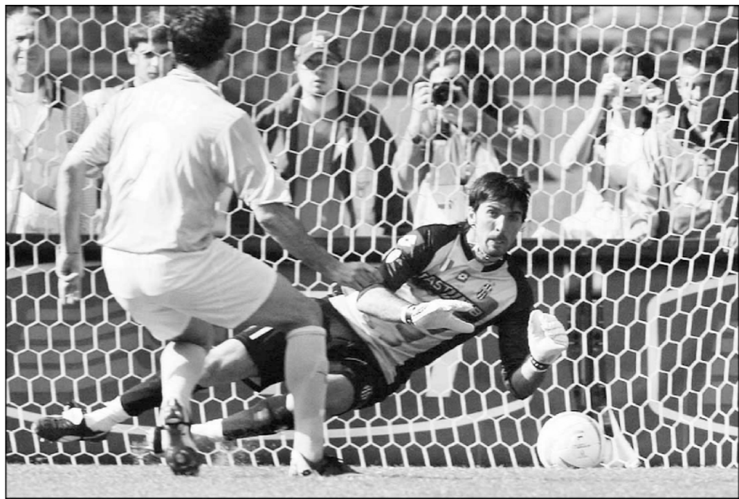
Juventus custodian Gianluigi Buffon (R) saving a penalty from Lazio's Stefano Fiore at Rome's Olympic Stadium on May 3.

In the day's other matches, Modena drew 1-1 with Empoli and Perugia were held to a 0-0 draw by Brescia.