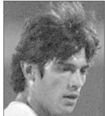
ROQUE SANTA CRUZ

Bayern coach Ottmar Hitzfeld said Santa Cruz, who has already injured ligaments in his left knee twice this season, would have further tests on Monday.