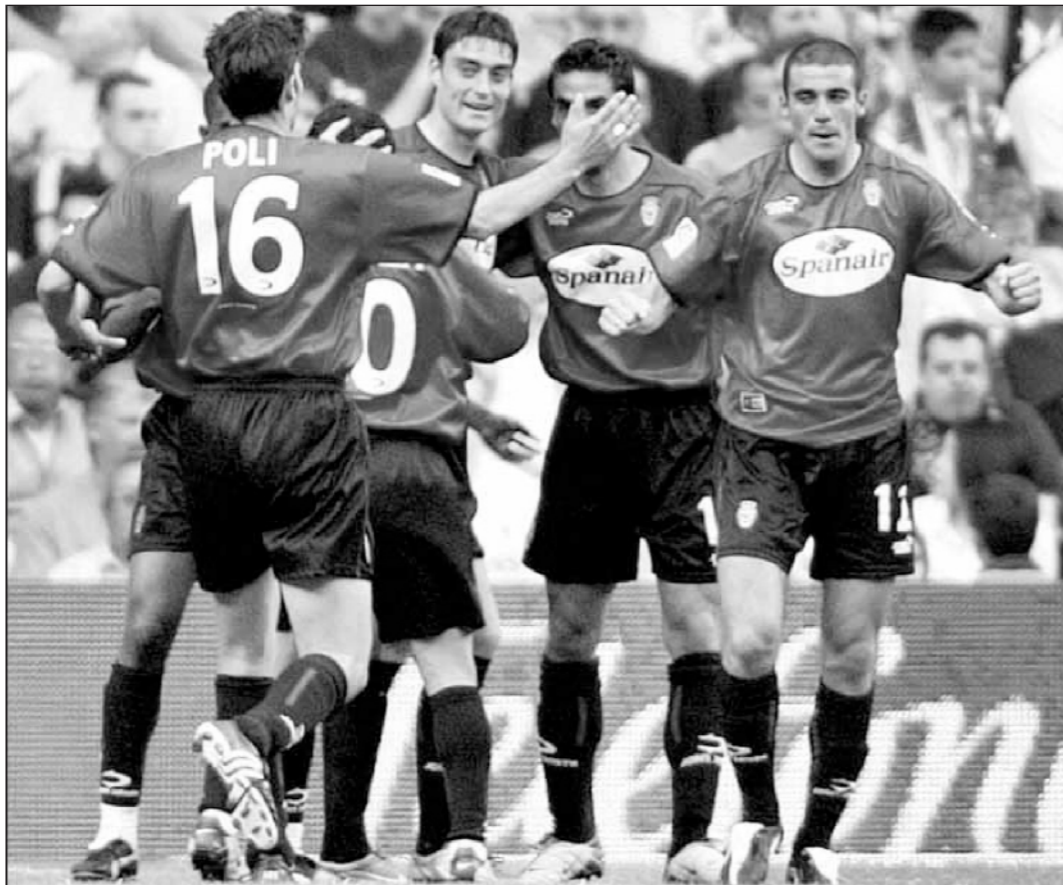
Mallorca players celebrate one of their five goals against Real Madrid at the Santiago Bernabeu Stadium in Madrid on May 3.

"George knows he can never drink again so perhaps his gambling is a substitute - providing the excitement and pleasure he used to find in the pub," a friend of Best was quoted as saying.