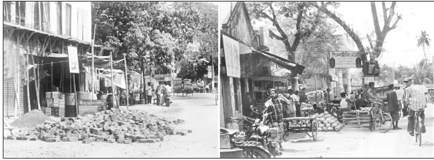
( Left-right ) Construction materials and fruits have occupied a good portion of roads at two important points in Magura town causing great sufferings to people.

aged to escape. The villagers told BSS that they had been observing suspicious movement of a microbus around the village since the day of the incident. On Thursday midnight, the microbus tried to enter Kashorbazar, but it fled hurriedly in face of strong vigilance by villagers. Mymensingh Police super visited the spot on Wednesday. He told this correspondent that the gang had been committing dacoities in the area for a long time. He said police had conducted several drives to nab other members of the gang. Police informed this correspondent that there had been a number of dacoity and murder cases against the dead dacoits.