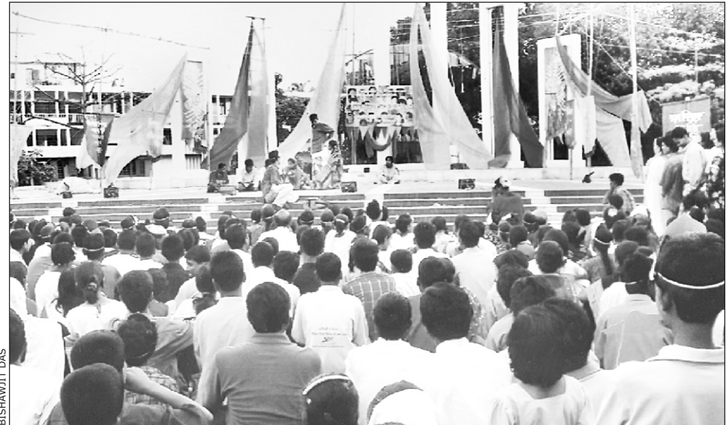
A crowd enjoys one of the performances at the festival.