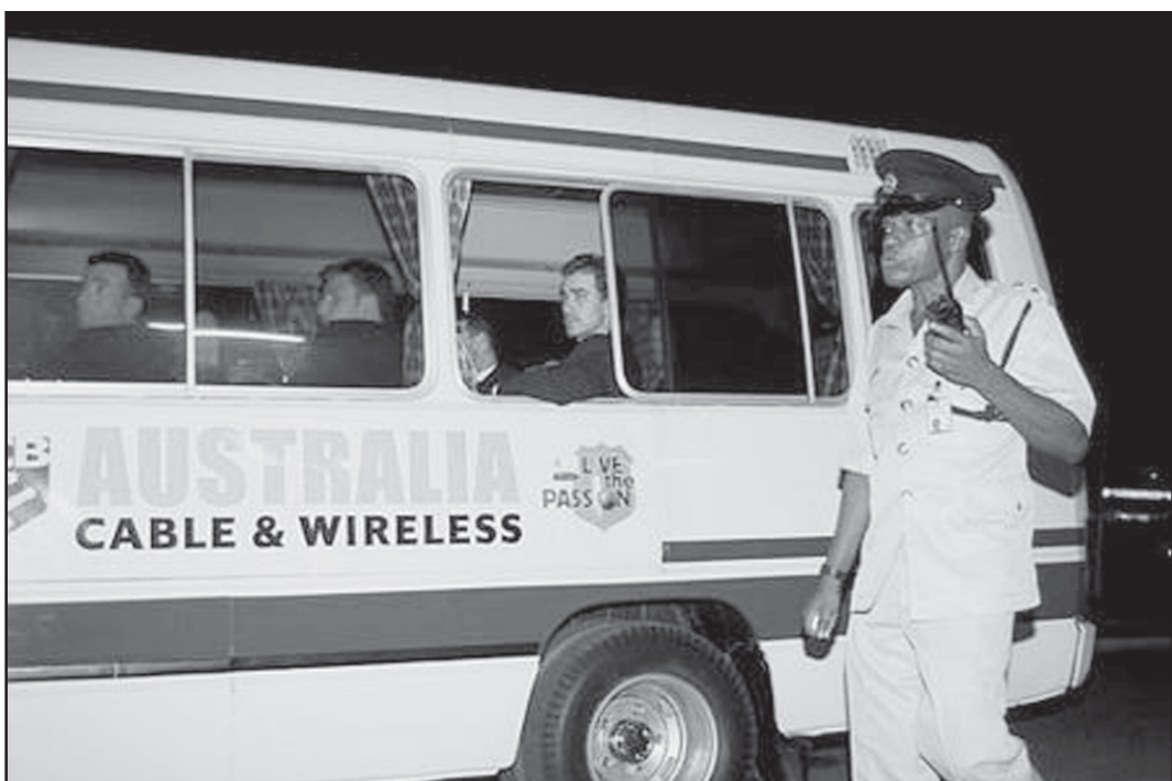
With a police officer at right, Justin Langer looks through a window shortly after the arrival of the Australian cricket team at the Cheddi Jagan International Airport in Guyana on April 2.