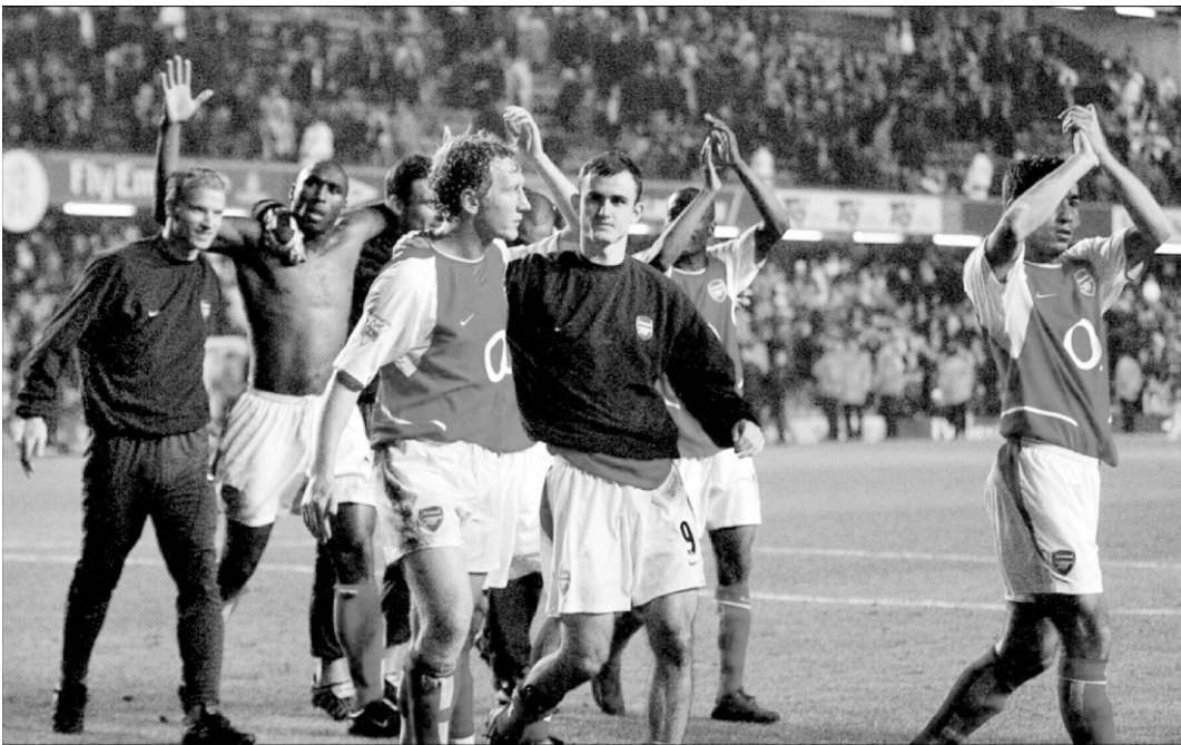
Arsenal players celebrate their FA Cup quarterfinal replay victory over Chelsea at Stamford Bridge in London on March 25.

This was the third time in as many seasons that Arsenal had knocked Chelsea out of the FA Cup and the win put Arsenal level with Everton's record of 23 appearances