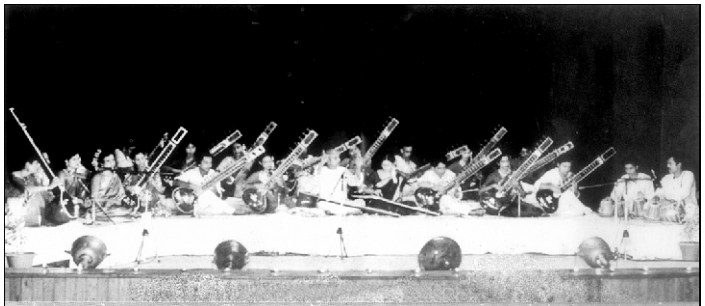
Participants of the Dhoibat Academy.

To expand the classical music movement Dhaibat was formed in 1991. Teaching and making the students able to proceed with the movement is the core goal of Dhaibat. The students study music for at least five years and get a certificate from the academy. Since its foundation many student have graduated and done very good in the field of music. The performance was the symbol of Dhaibat's excellence.