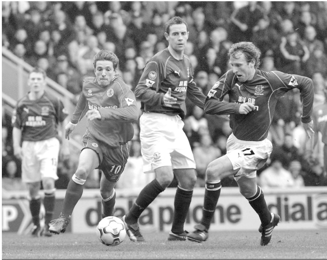
SWEET RETURN: Middlesbrough's Brazilian star Juninho (2nd L) runs around Everton's defence at the Riverside Stadium on March 1.