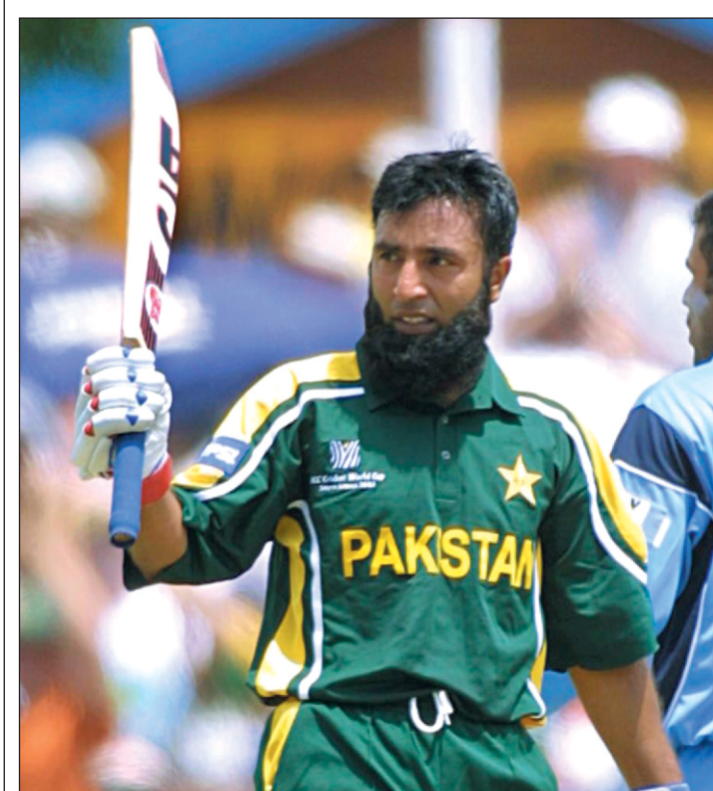
Saeed Anwar is enjoying his cricket.