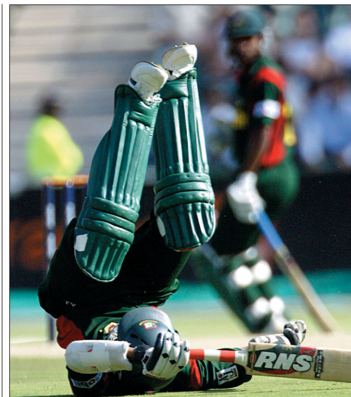
Bangladesh cricket is upside down.