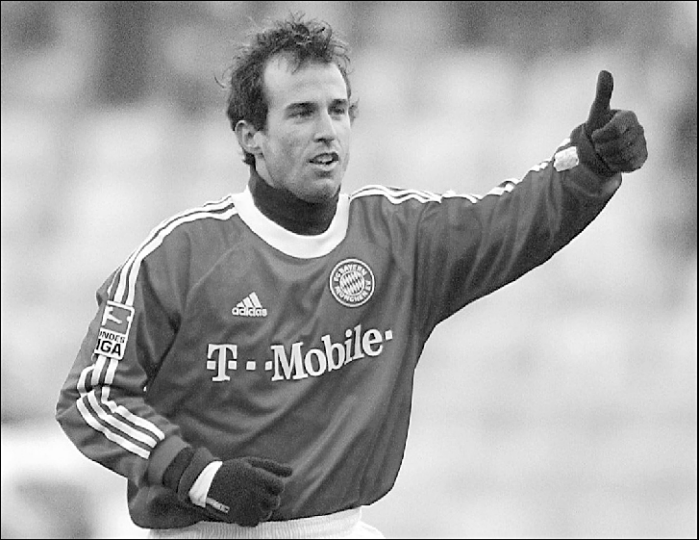
Veteran Bayern Munich midfielder Mehmet Scholl celebrates after scoring a goal during his hatrick against 1860 at Munich's Olympic Stadium on February 15.