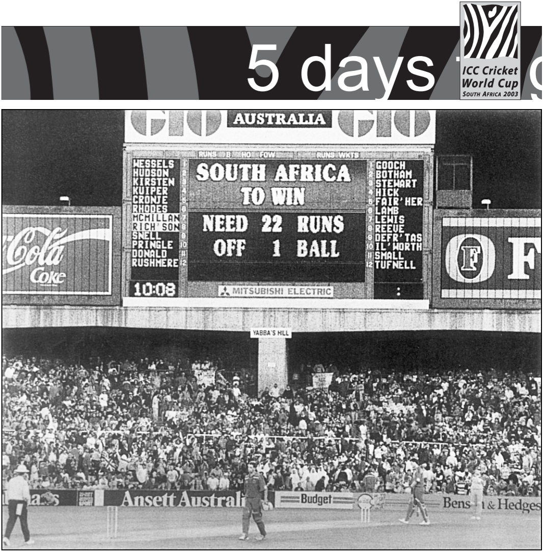
WHEN GOD WAS AN ENGLISHMAN: In the 1992 World Cup held in Australia and New Zealand a newly-introduced clause, the run-rate calculation during rain-interrupted matches became a joke when South Africa took on England in the semifinals. When rain interrupted the match, South Africa needed 22 from 13 balls. The very innovative playing conditions now enacted a farce at the Sydney Cricket Ground. When the players returned to the field the target was revised to 22 from one ball. All because the playing conditions did not allow playing time to be extended.