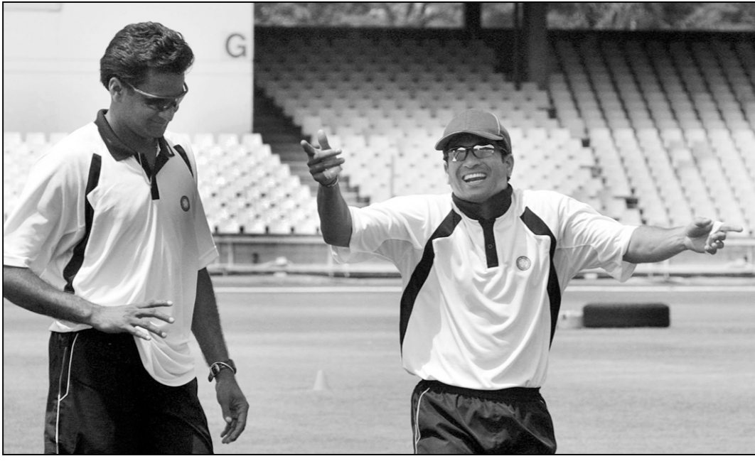
I'VE LEARNT A NEW DANCE STEP! Indian batting superstar Sachin Tendulkar is in a happy frame of mind as he jokes with teammate Javagal Srinath during fielding practice at Durban's Kingsmead cricket ground.