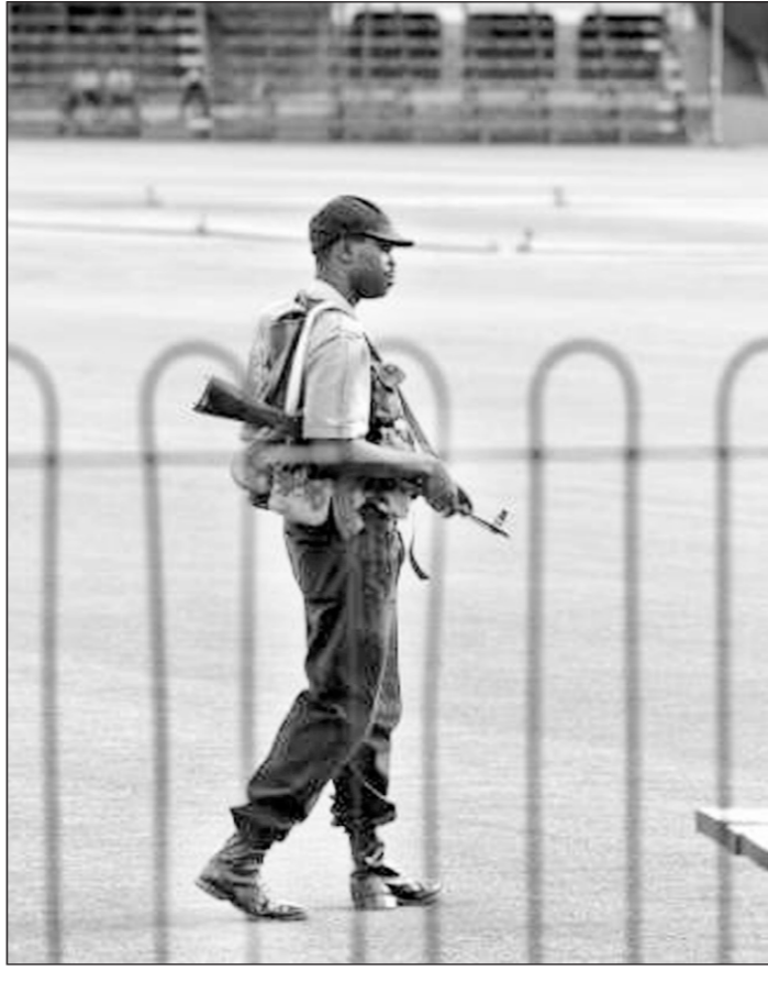
An armed Zimbabwean policeman stands guard at the Harare Sports Club ground on January 31.