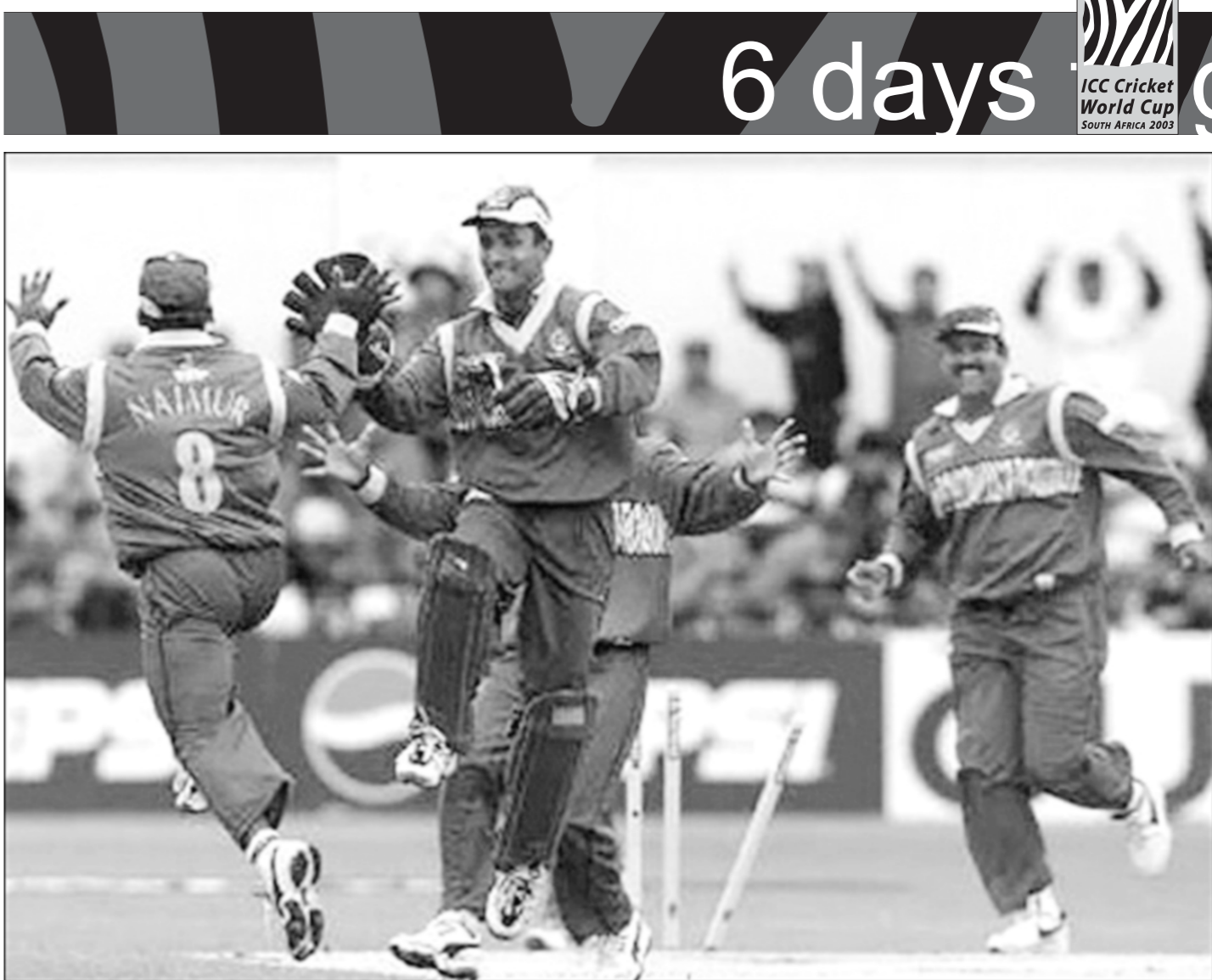
MOMENT OF GLORY: Bangladesh staged the biggest upset of the 1999 Cricket World Cup at Northampton on May 31. The Cup debutants defeated eventual finalists Pakistan in a Group League game.