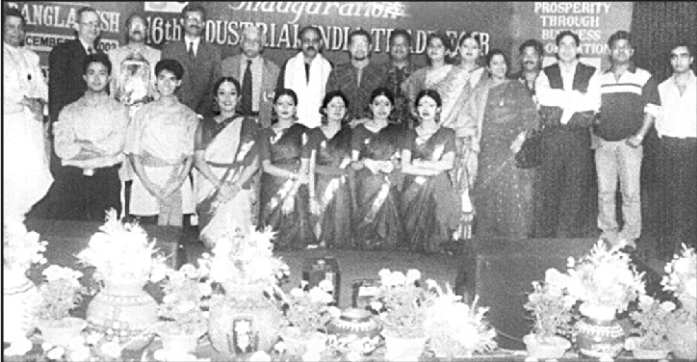
Bangladeshi cultural delegation at the Kolkata Trade Fair

occasion the Bengal National Chamber and the Commerce Industries at a local hotel. In the banquet a laudable cultural programme was presented with songs and dance. Later on, in the large fair pavilion the national level artistes performed in a cultural programme of three hours. The programme enriched the cultural and trade relation of both the Bengals. The dances and songs