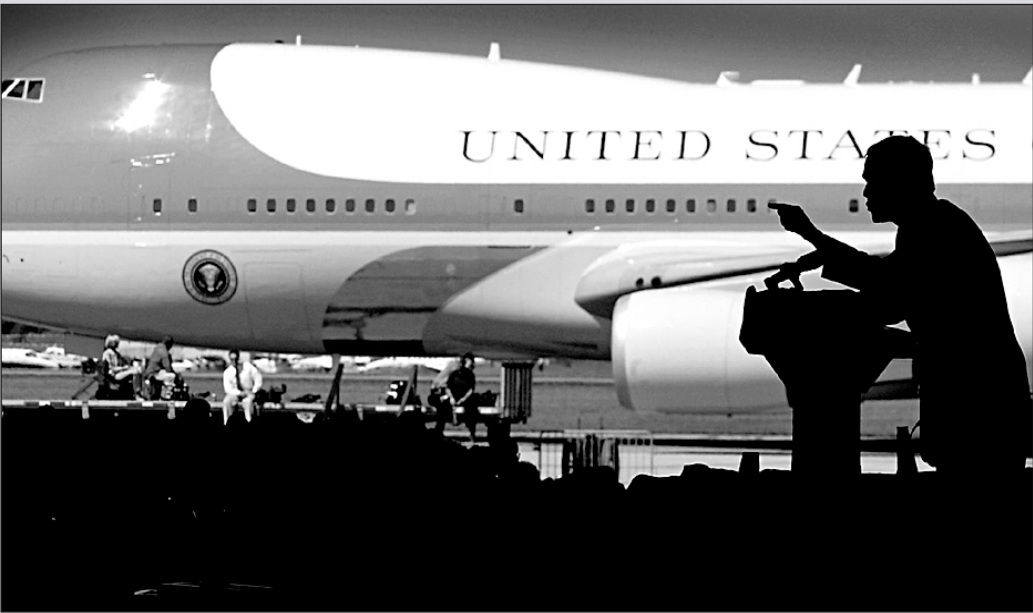
For the better or worse?