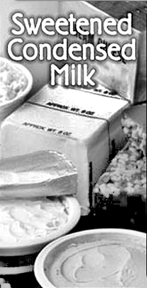
Condensed milk controversy!