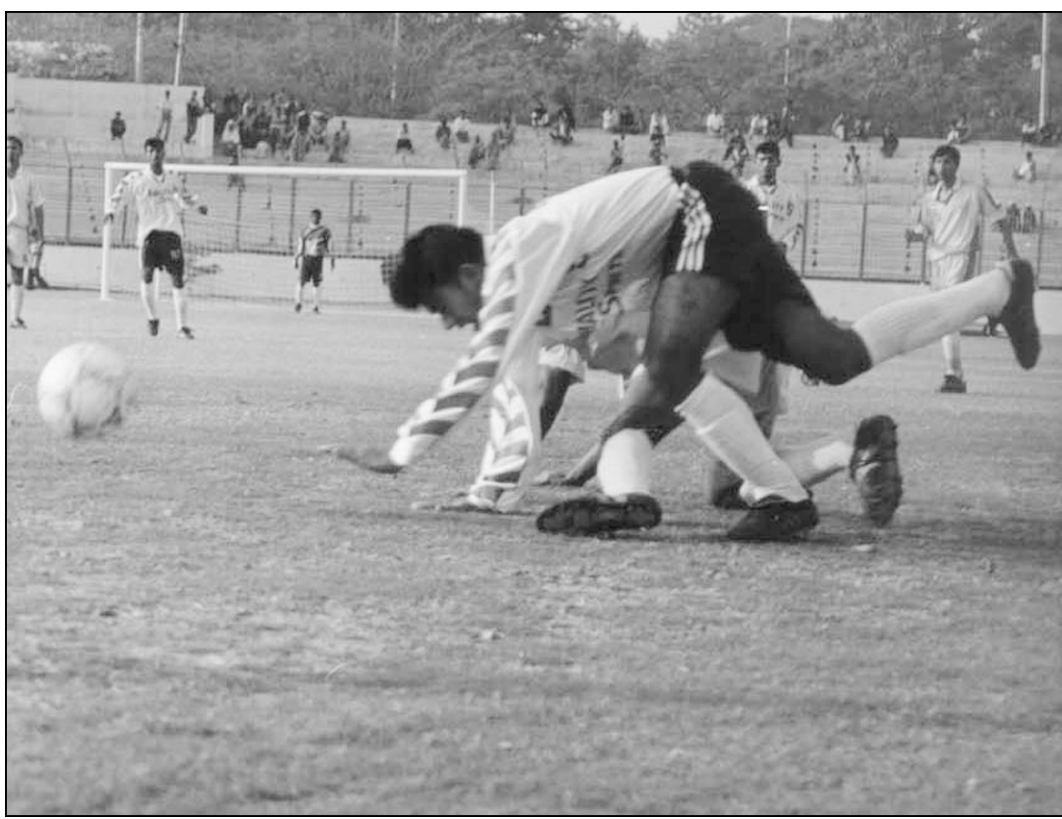
Action from yesterday's Elite Paint Senior Division Football League encounter between Quality Sports Club and Customs Excise & Vat Club at the MAAziz Stadium.