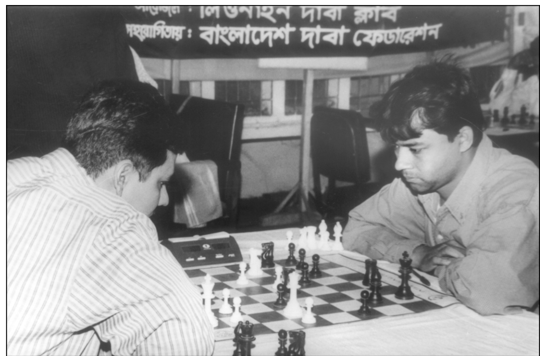
Scene from yesterday's third round engagement of the Prime Bank fifth International Rating Chess tournament at the Bangladesh Chess Federation auditorium.

"The ECB can be in no doubt about the government's views," Blair told Duncan Smith, adding: "There are no legal powers available to the government to ban a sporting team from participation."