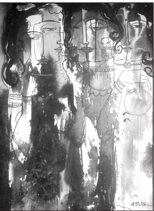
"A woman and a deer in the forest", "Torn flower" and "Gathering"