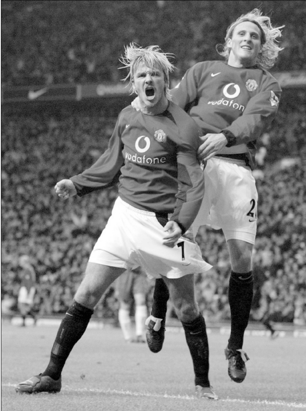
Manchester United's Diego Forlan (R) and David Beckham are over the moon after the opening goal against Birmingham at Old Trafford on December 28.