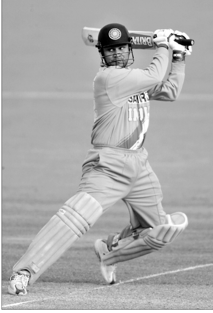
India's Virender Sehwag square cuts against New Zealand at McLean Park in