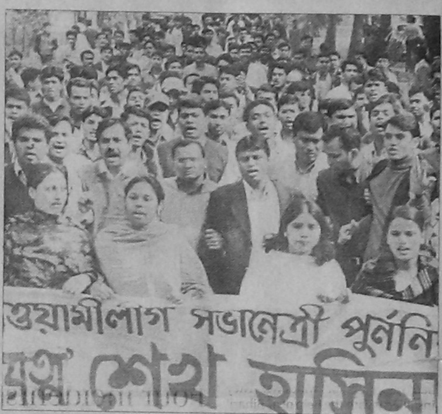
The Bangladesh Chhatra League took out a procession on the Dhaka University Campus yesterday hailing the reelection of Sheikh Hasina as the Awami League president.