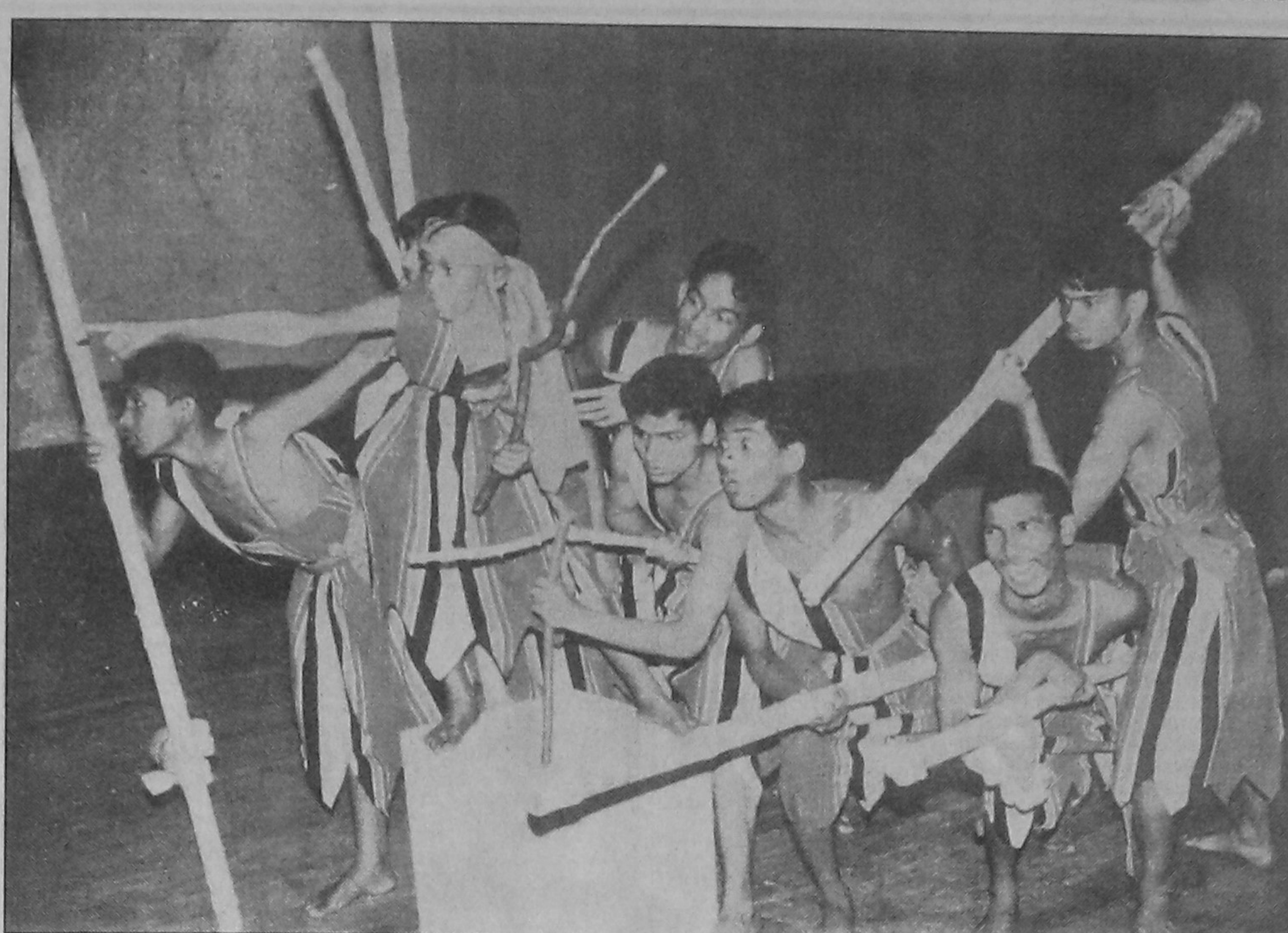
Children staged a drama at the Mahanagar Natya Mancha in the city yesterday as part of the closing ceremony of a programme titled 'Cultural development of underprivileged children', organised by the Theatre Centre for Social Development.