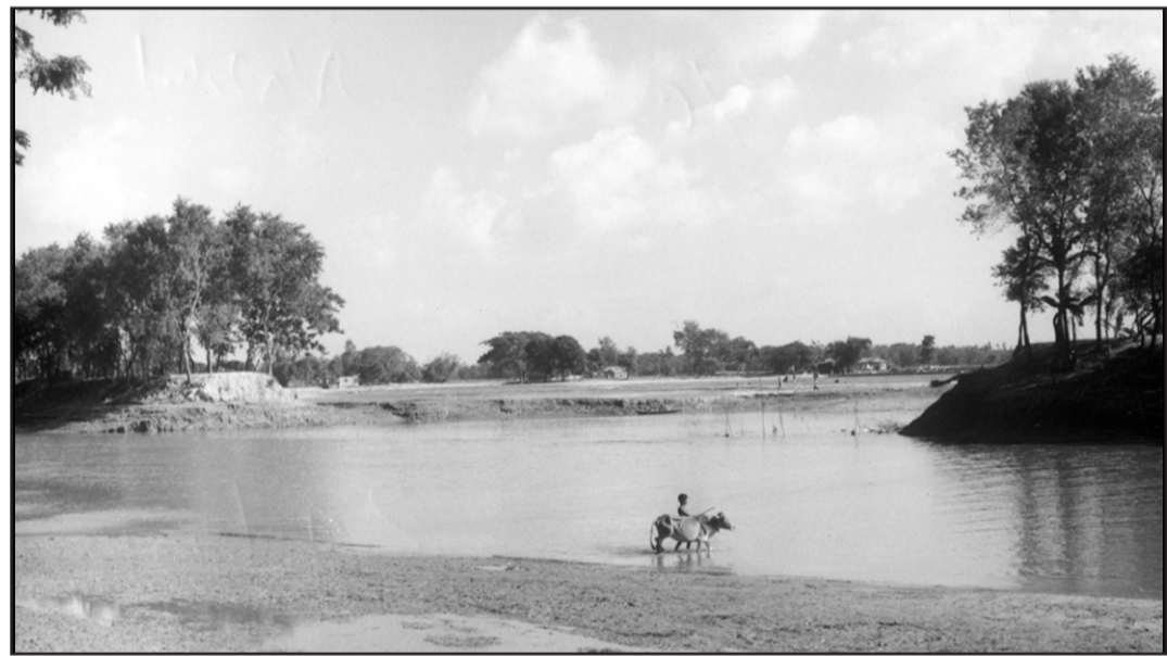
A villager washes his cow in a water body near the damaged Sonail embankment at Goderhat in Sadar upazila in Gaibandha. Over 1000 feet of the dam washed away during the last flood.

Later police rescued the critically injured boys in an unconscious state and arrested Sajjad.