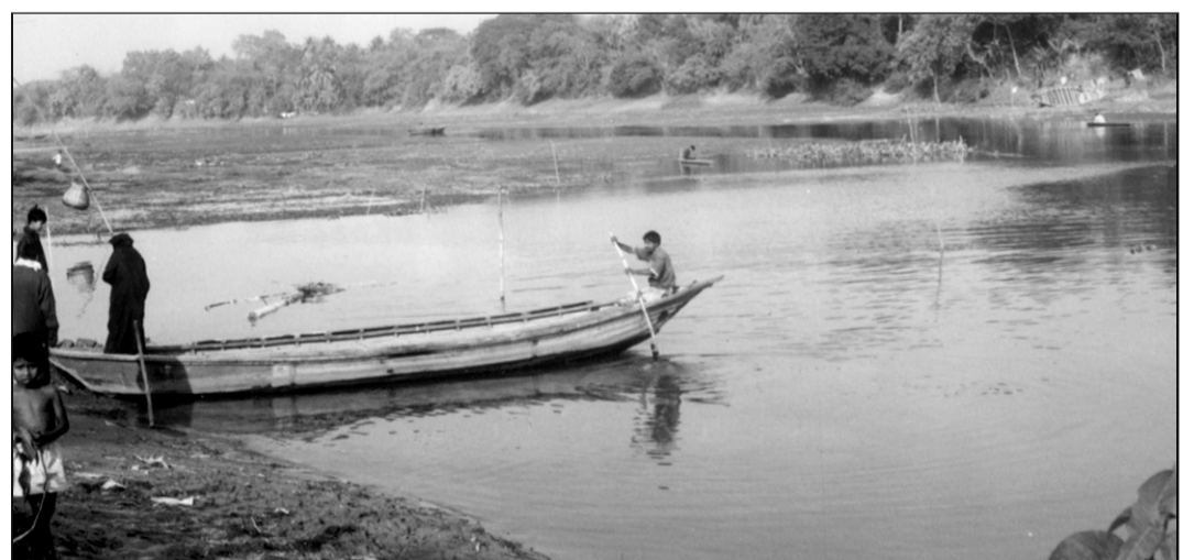
A boatman ferrying people across the Nabaganga River at Parnanduali in Sadar upazila, Magura. At the advent of the winter the Nabaganga lost navigability at many places due to silt build-ups.

However, "Hali piaj" will be harvested in the month of March or April. One farmer told that the prices of this type of onion must increase as many of the farmers could not cultivate "Hali piaj" owing to acute scarcity of onion seeds in the district during seed-sowing season.