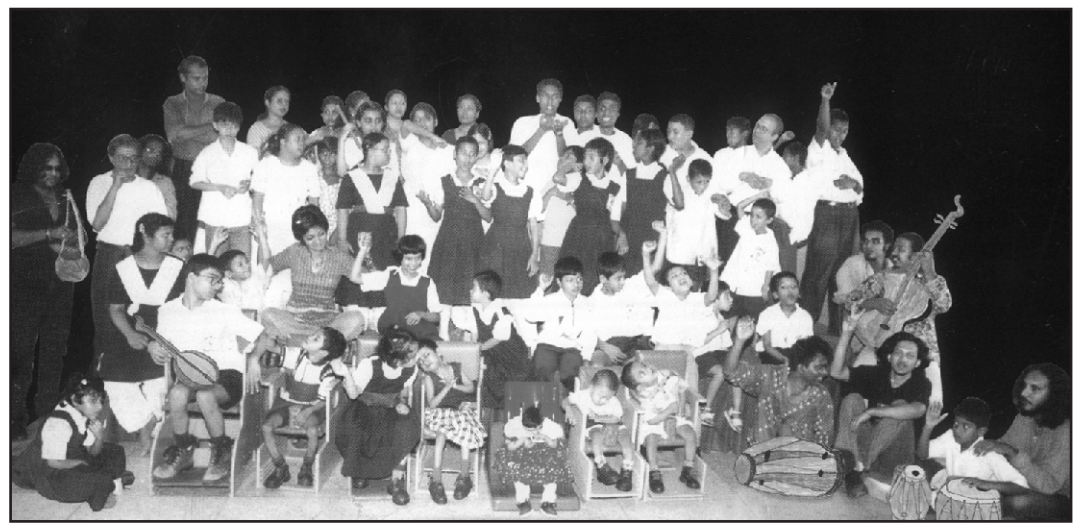
Differently abled children who joined in the concert, seen with the singers

The concert was performed in a very informal fashion. Blues, jazz, folk tunes, psychedelic orchestration and fusion were, in one word, fantastic. It gave a flavour apart from the mainstream band music; every song was deeply thought-provoking. The alternative tunes made us think of the differently abled, who are in fact alternative individuals of our society. The concert literally spent out the words "Yes, you're OK" to the differently abled. Lastly, all the differently abled children gathered with the performers and sang together that was, in fact, moving.