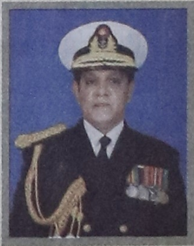
Chief of the Naval Staff