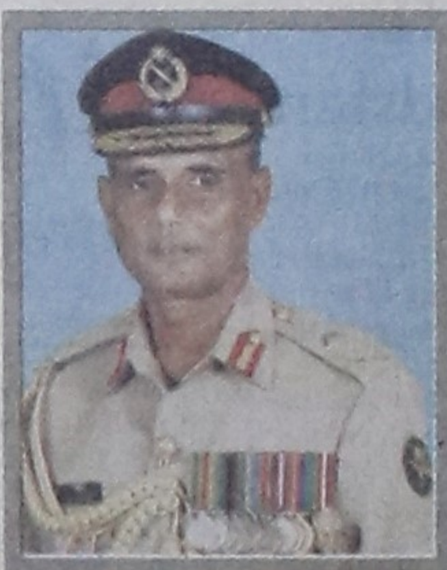
Chief of Army Staff