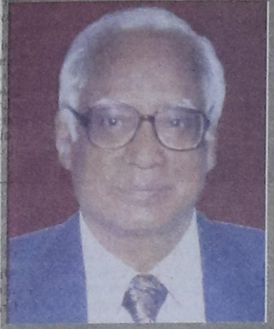
President and Supreme Commander of the Armed Forces People's Republic of Bangladesh