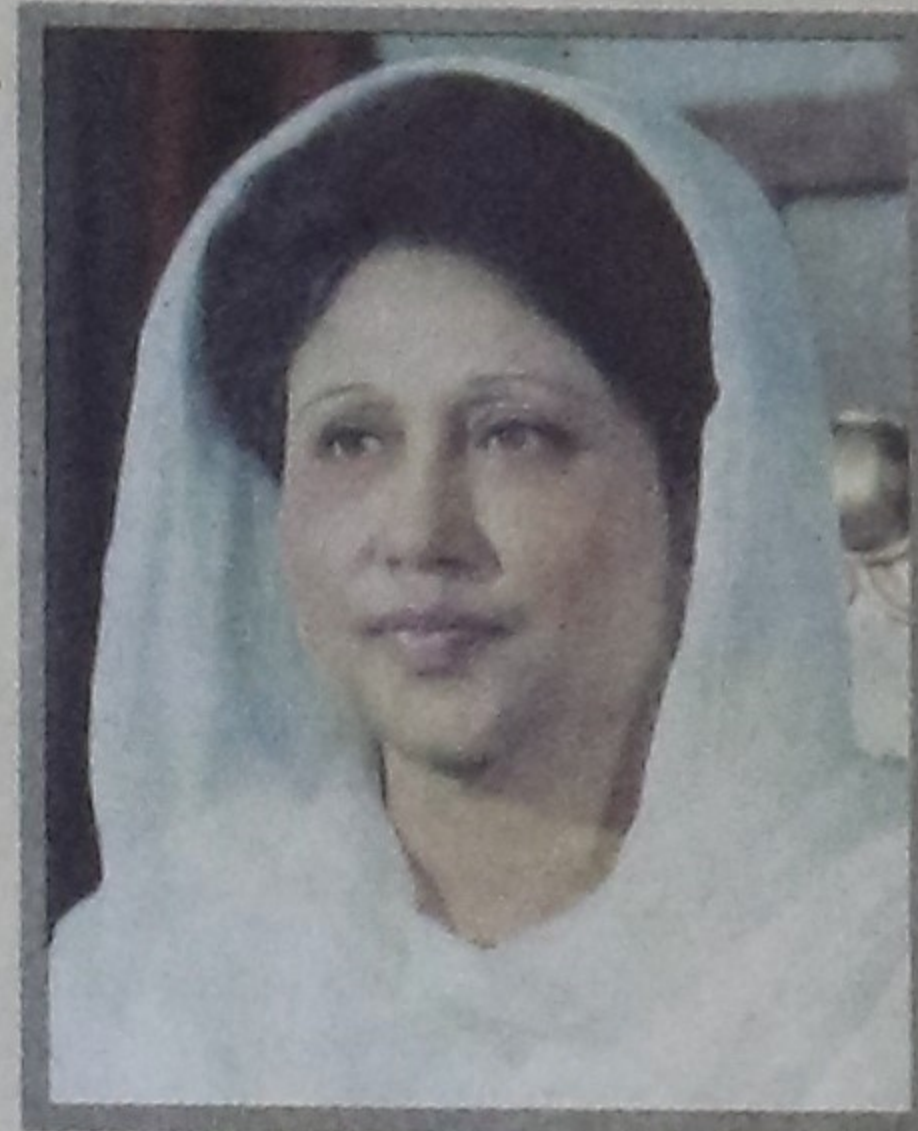
Prime Minister Government of the People's Republic of Bangladesh.

The most important contribution that DSCSC makes to our armed forces is the fostering of the culture of jointness. Jointness is something that can only be accomplished by an understanding of empathy in each other's values and traditions amongst the officer corps of the three services. It not only opens up the possibility for an officer as to what he can bring to the needs of warfighting skills of other services, but also what he can take by way of offer from them. Camaraderie and bondage established in the company of each other strengthen the social ties of the military elite that promises immense potentials of growth and development for the armed forces as a whole. DSCSC is that abode of communal living that has been instrumental in changing the outlook of a modern military man from wearing an exclusively single service mind-set to that of a joint one in the true spirit of the word jointness. The way in which the education of the modern military officer is being transformed with every passing decade since the end of the second world war is a tribute to the dynamic commencement