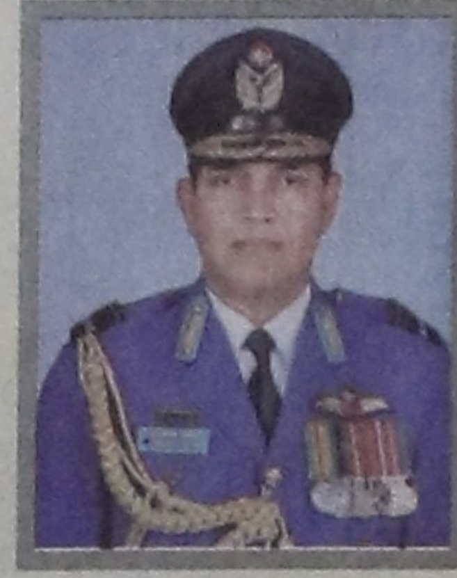
Chief of the Air Staff