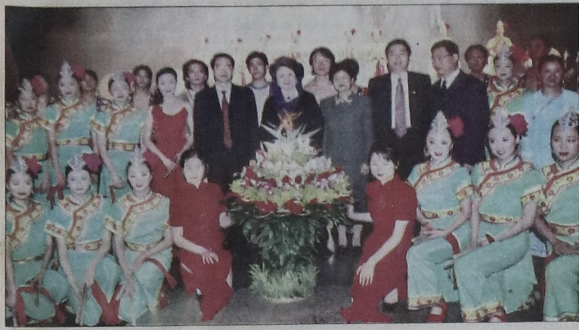
Prime Minister Khaleda Zia pose with the performers of a cultural show at the World Trade Centre at Kunming on Friday. The government of Yunnan province organised the cultural show in honour of the PM during her visit to China.