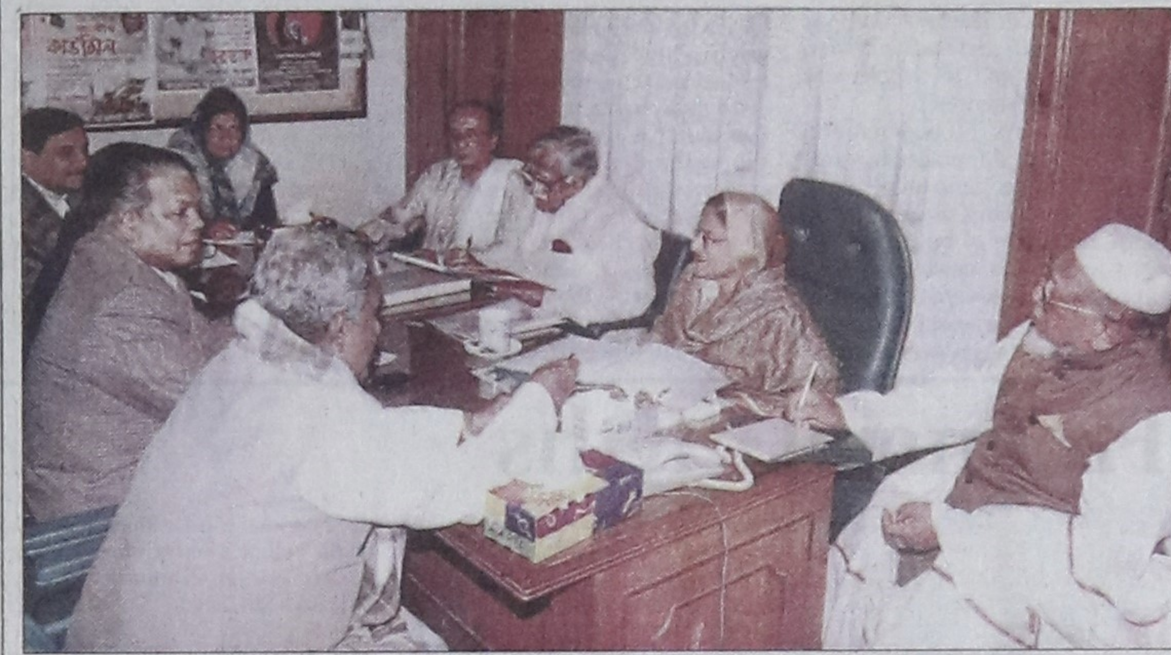
Awami League President Sheikh Hasina speaks at the party's presidium meeting at its Dhanmondi office in the city yesterday.

They also seized four firearms, four other weapons and two bullets during the period and filed three cases against seven people under the Arms Act, said a police press release.