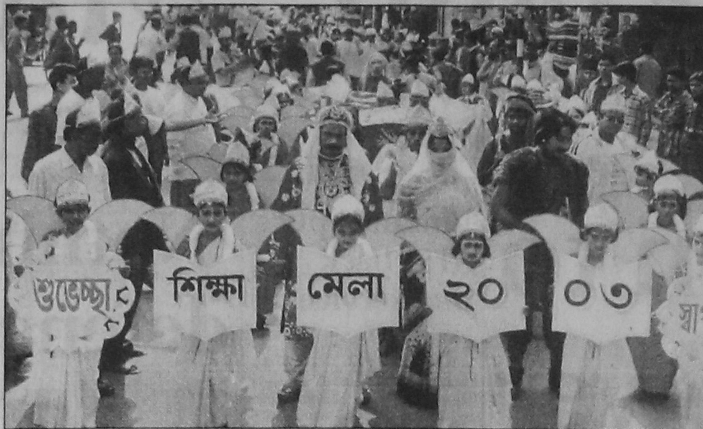
A colourful rally was brought out in the city to mark the National Education Week that began yesterday.

The inaugural ceremony of Leo Club of Dhaka Kawranbazar will be held.