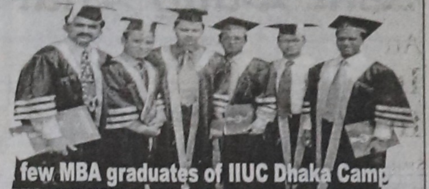
few MBA graduates of IIUC Dhaka Camp

IIUC Dhaka Campus offers MBA Program for Executives (Evening shift) for the coming semester. Graduates with two years' of work experience or holding Master's degree are eligible to apply for admission into the program. Total cost of the MBA Program is Tk. 90,000 only. BBA graduates can complete MBA program within 1 year (36 credit hours) and for them the cost is Tk. 58,000/- only. Last date for applying is 02 January 2003 and the viva voce will be held at 10:00 am on 03 January 2003. Admission form may be collected upto 8:00 pm everyday. IIUC Dhaka Campus maintains international standard of education. Textbooks are provided to all the students. Separate and secure arrangements are also available for female students. Many IIUC Dhaka Campus MBA graduates are placed at the top executive level. Admission forms are also available for the coming semester into BBA and CSE programs as well. For details, please contact the Dhaka Campus of IIUC, House-23, Road-3, Dhanmondi, Dhaka or call- 8629947, 8613294, 9670220, 9670193.