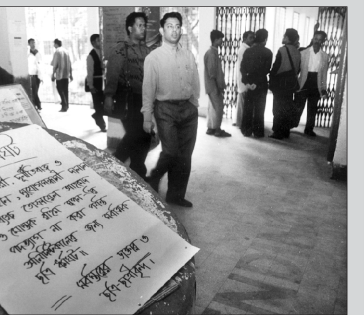
So much for hippocratic oath

The internees and medical students of Dhaka Medical College/Hospital (DMC/H) went on an indefinite strike (though withdrawn post haste). It was withdrawn because we realised that we had gone on a strike for a very wrong cause. By our strike we were supporting extortion of money by a group of students headed by an internee doctor who did not relinquish his student union post.