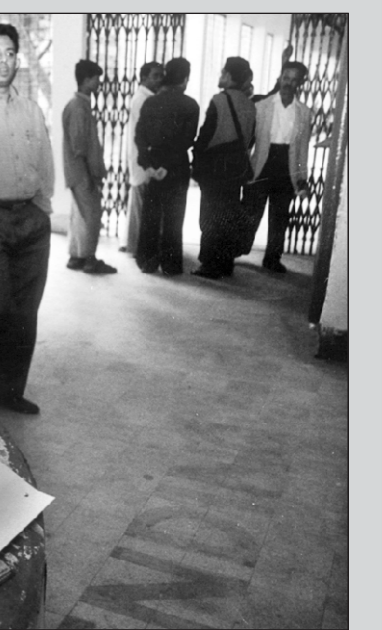
So much for hippocratic oath

The Union was over, the Principal did not dissolve it. The Union was declared defunct only when things went wrong and not when it was due. Both the Principal and the student leader are supporters of the same party and were in connivance with each other when the going was good.