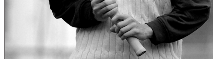
RICHARD 'SANTA CLAUS' DAWSON! The England cricketer during the team's net practice at the MCG yesterday.

Richard 'Santa Claus' Dawson! The England cricketer during the team's net practice at the MCG yesterday.