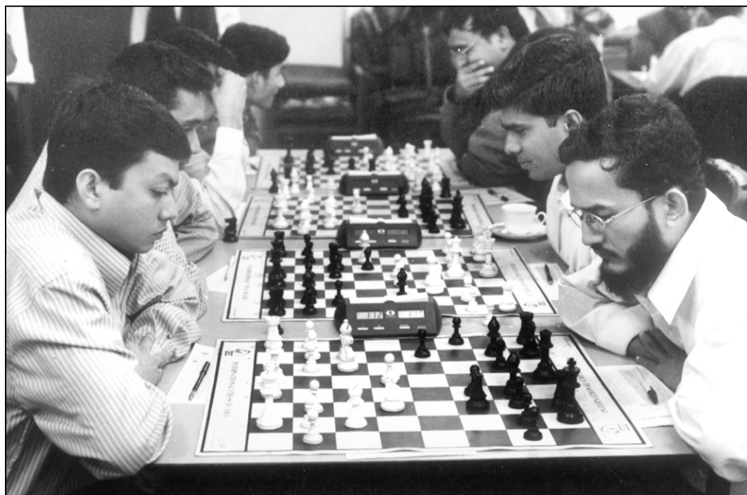
Scene from the thirteenth round of the First Division Chess League at the Chess Federation auditorium yesterday.